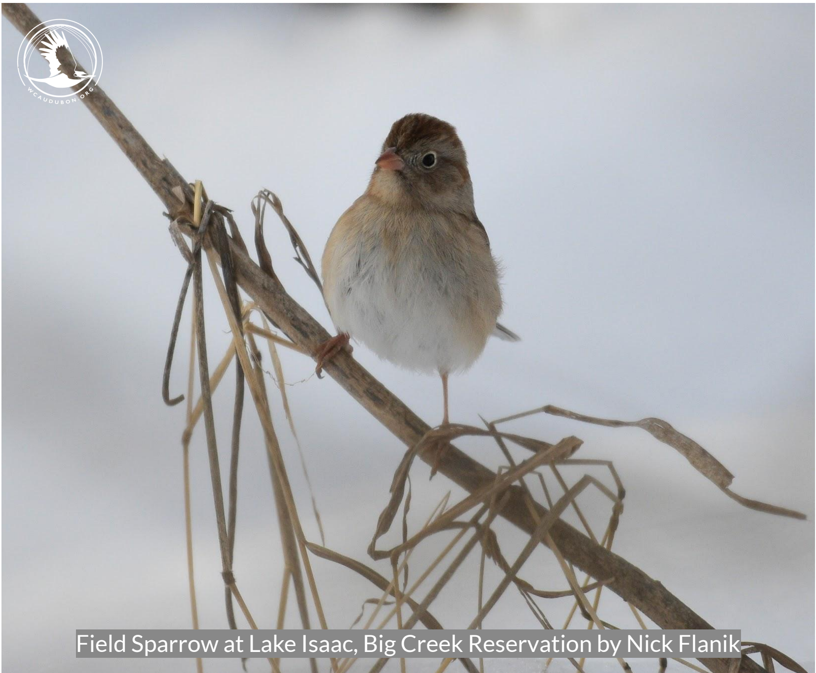
Field Sparrow at Lake Isaac, Big Creek Reservation