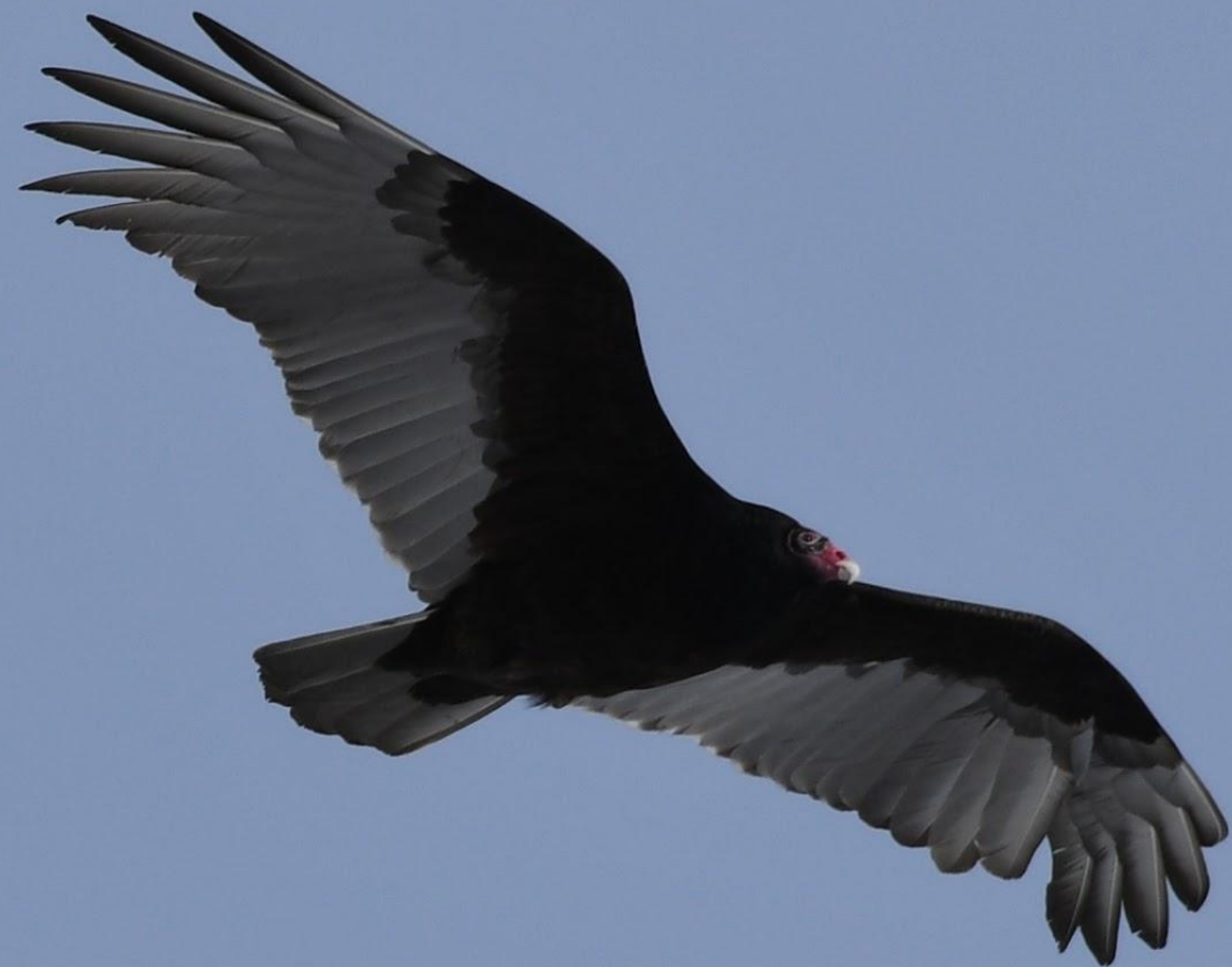
Turkey Vulture, Woodvale Cemetery by Nick Flanik