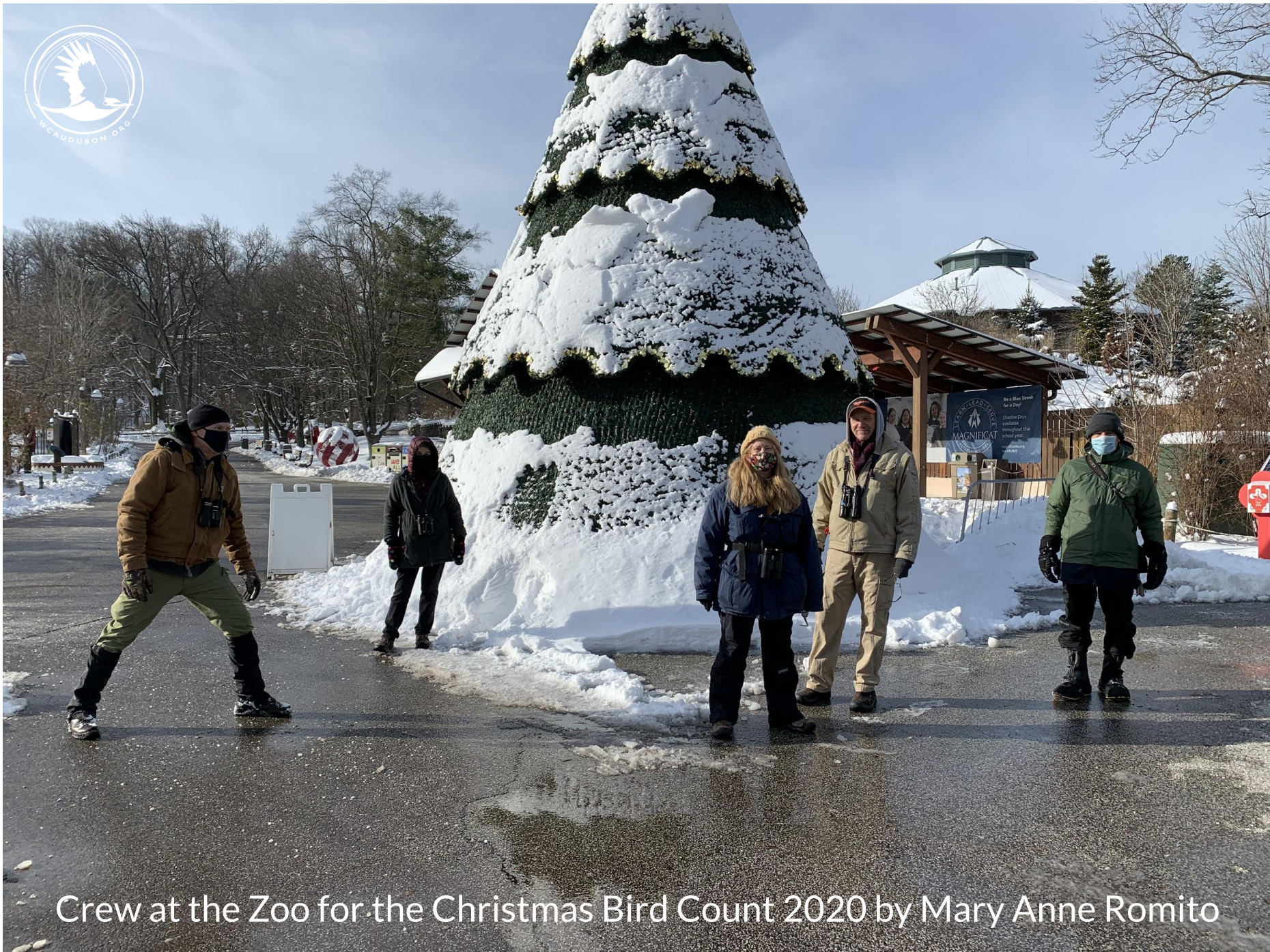
Crew at the Zoo for the Christmas Bird Count 2020