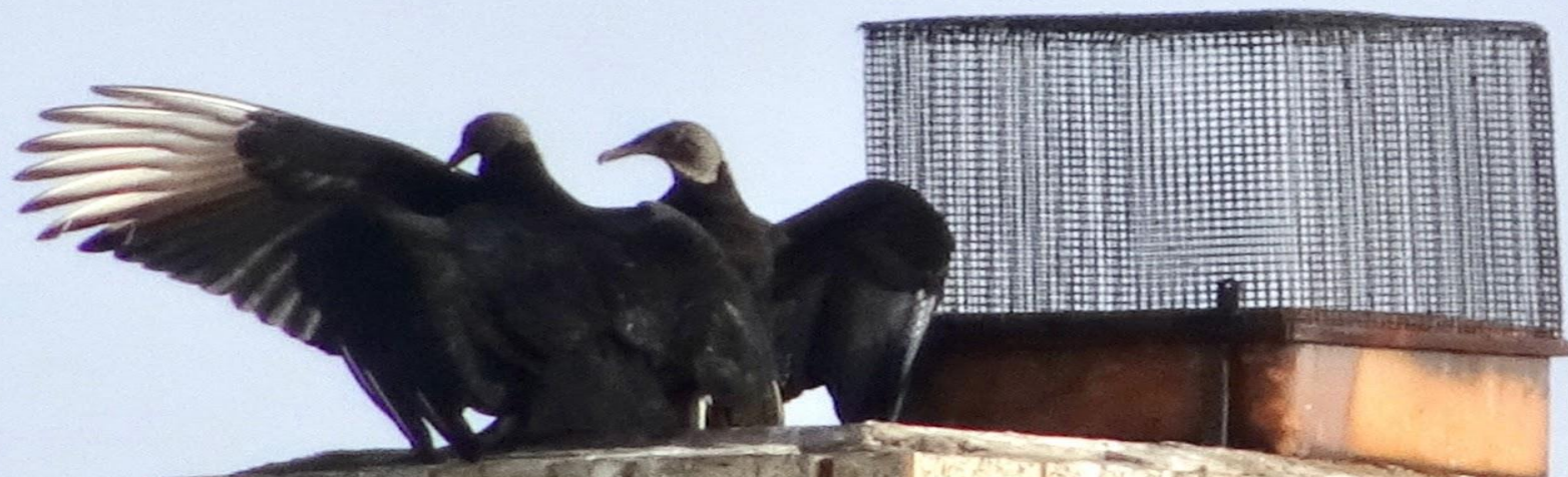
Black Vultures - Lakewood Circle Christmas Bird Count 2020