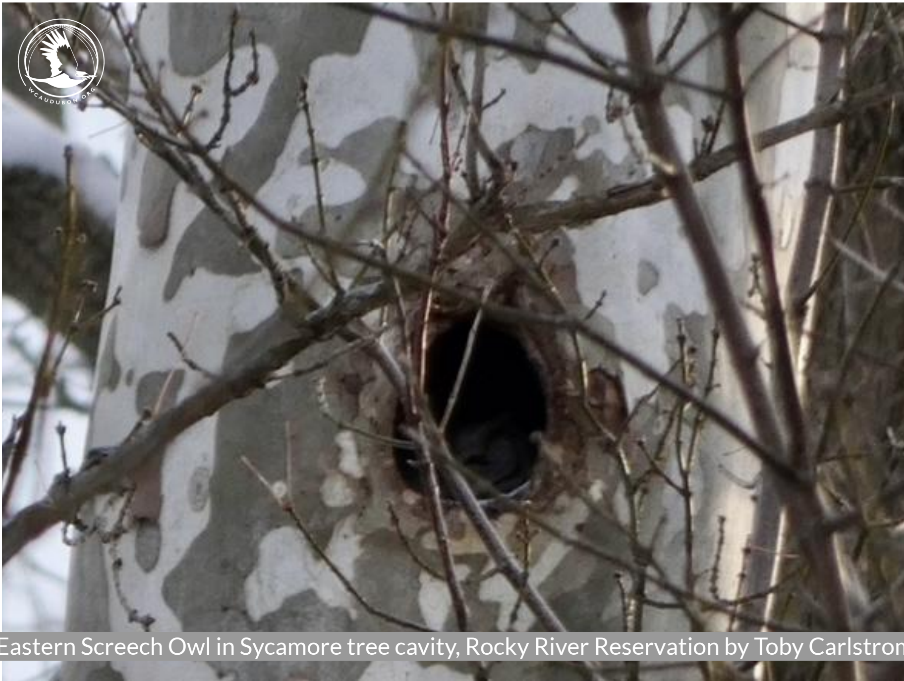
Eastern Screech Owl in Sycamore tree cavity, Rocky River Reservation by Toby Carlstrom