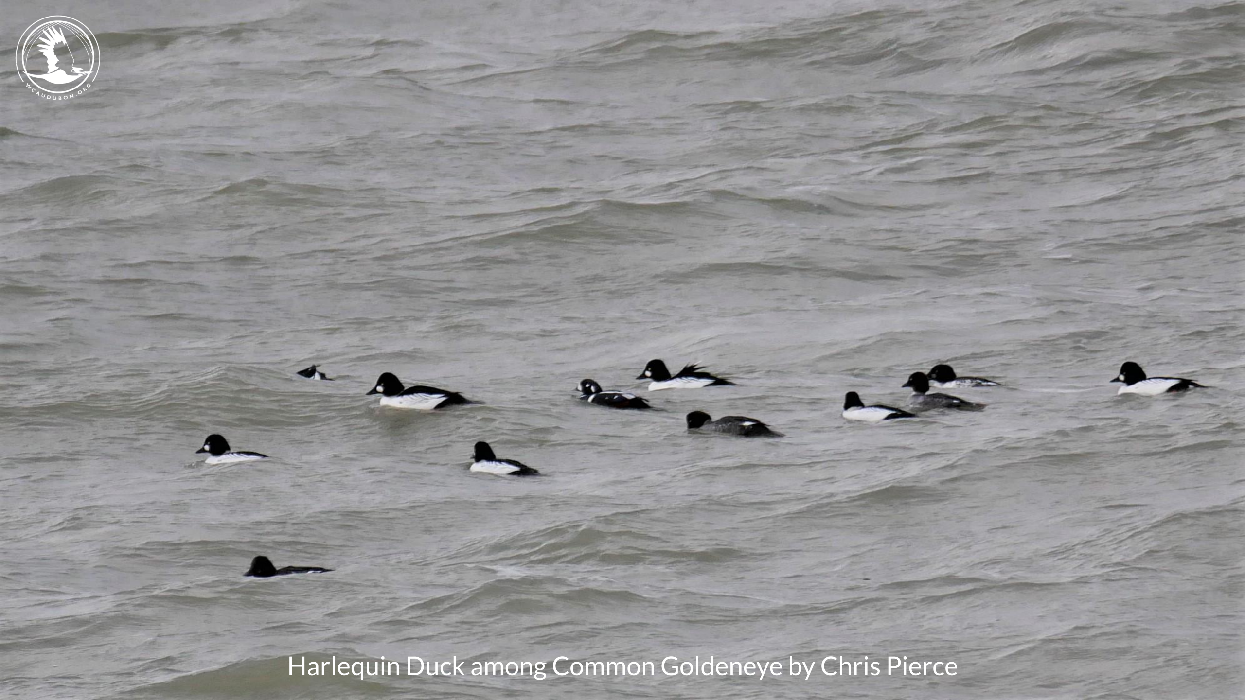
Harlequin Duck among Common Goldeneye