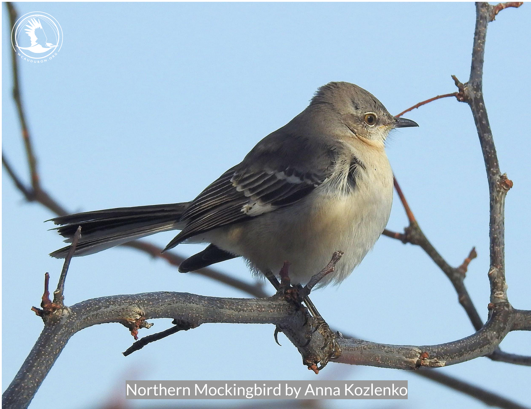
Northern Mockingbird