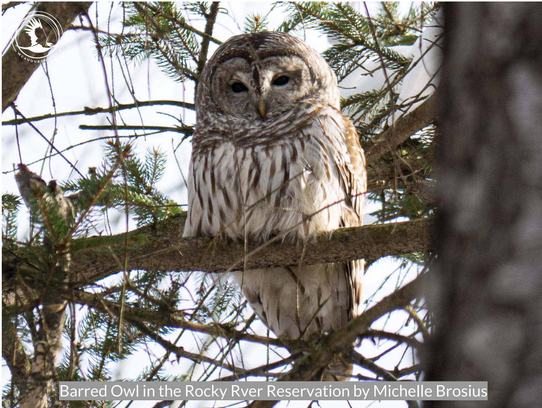
Barred Owl in the Rocky Rver Reservation