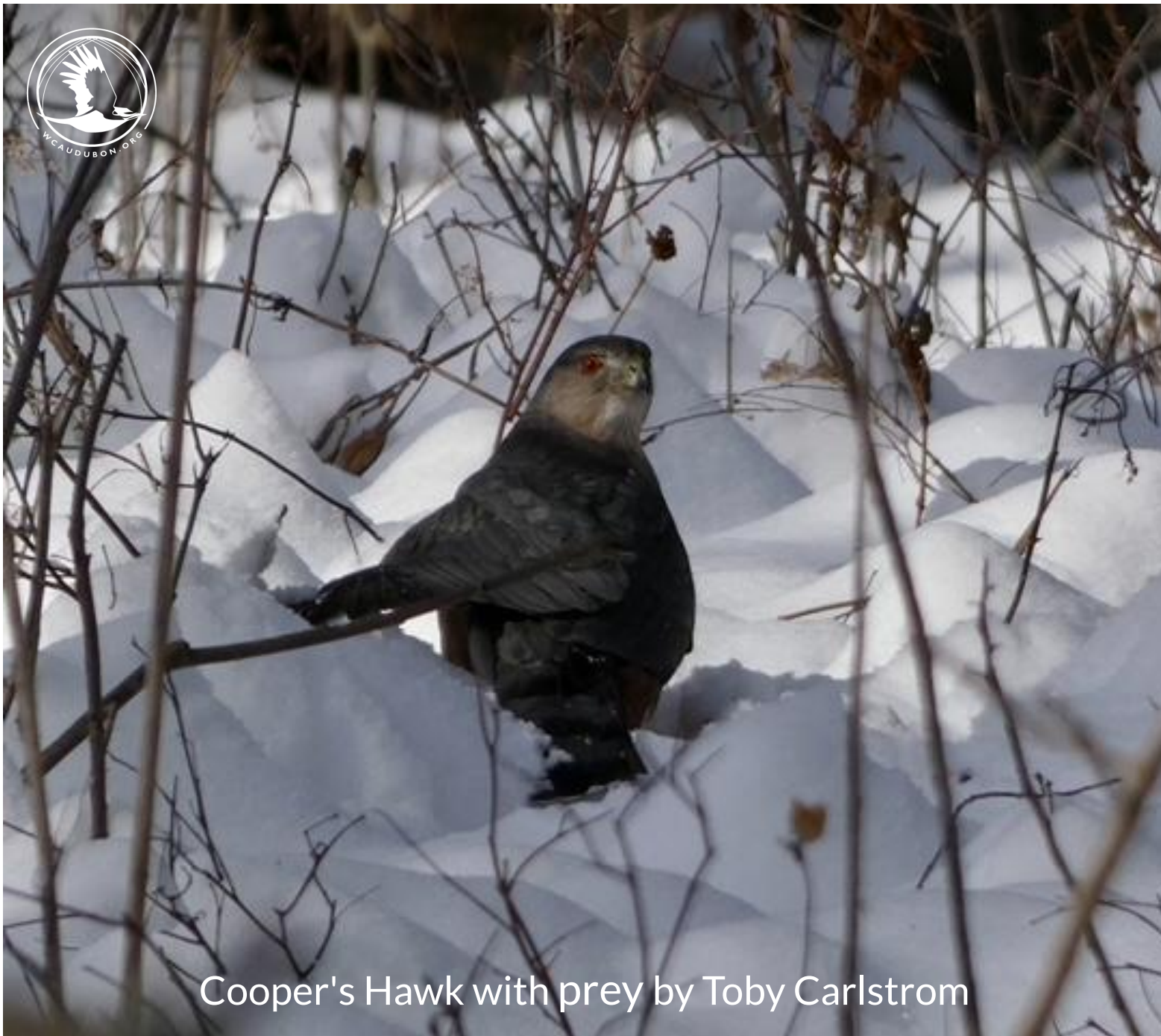
Cooper's Hawk with prey