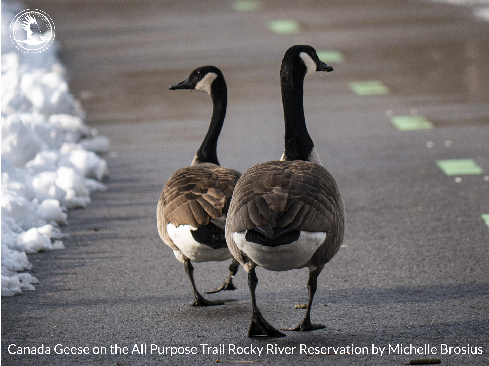
Canada Geese on the All Purpose Trail Rocky River Reservation by Michelle Brosius