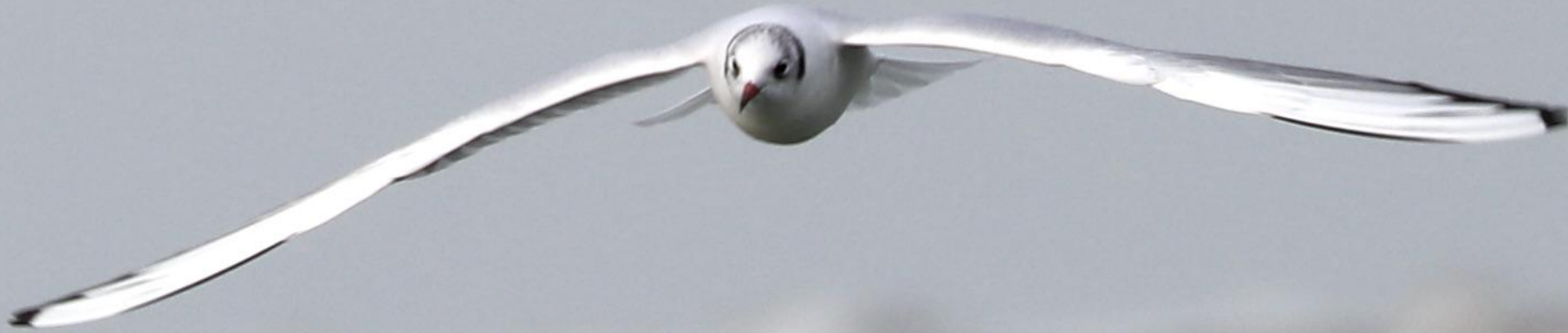
Black-headed Gull by Lenore Charnigo