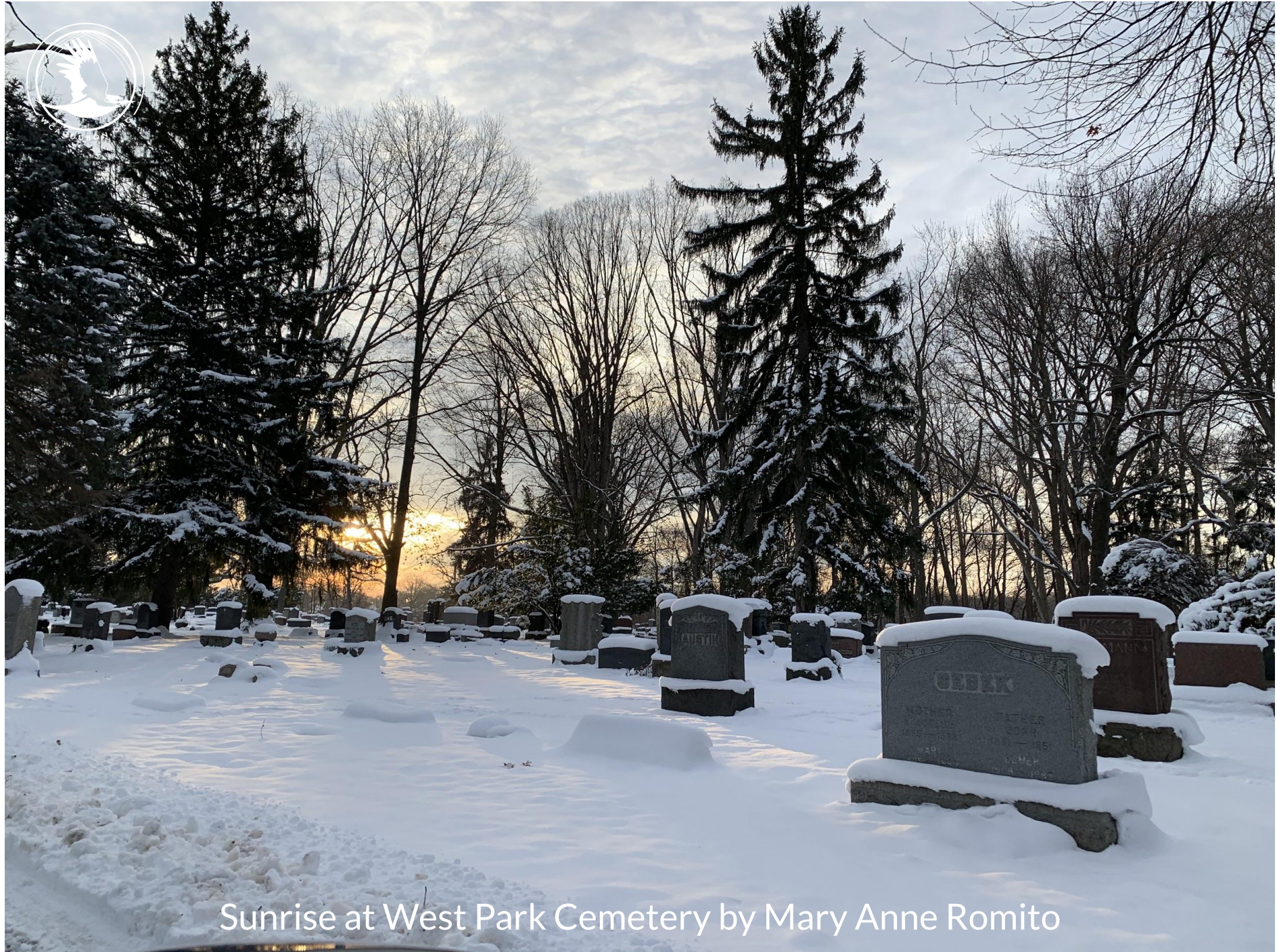
Sunrise at West Park Cemetery