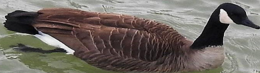
Cackling Goose (above) and Canada Goose (below)