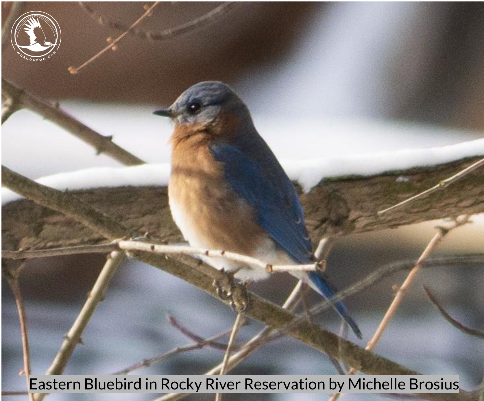
Eastern Bluebird in Rocky River Reservation by Michelle Brosius