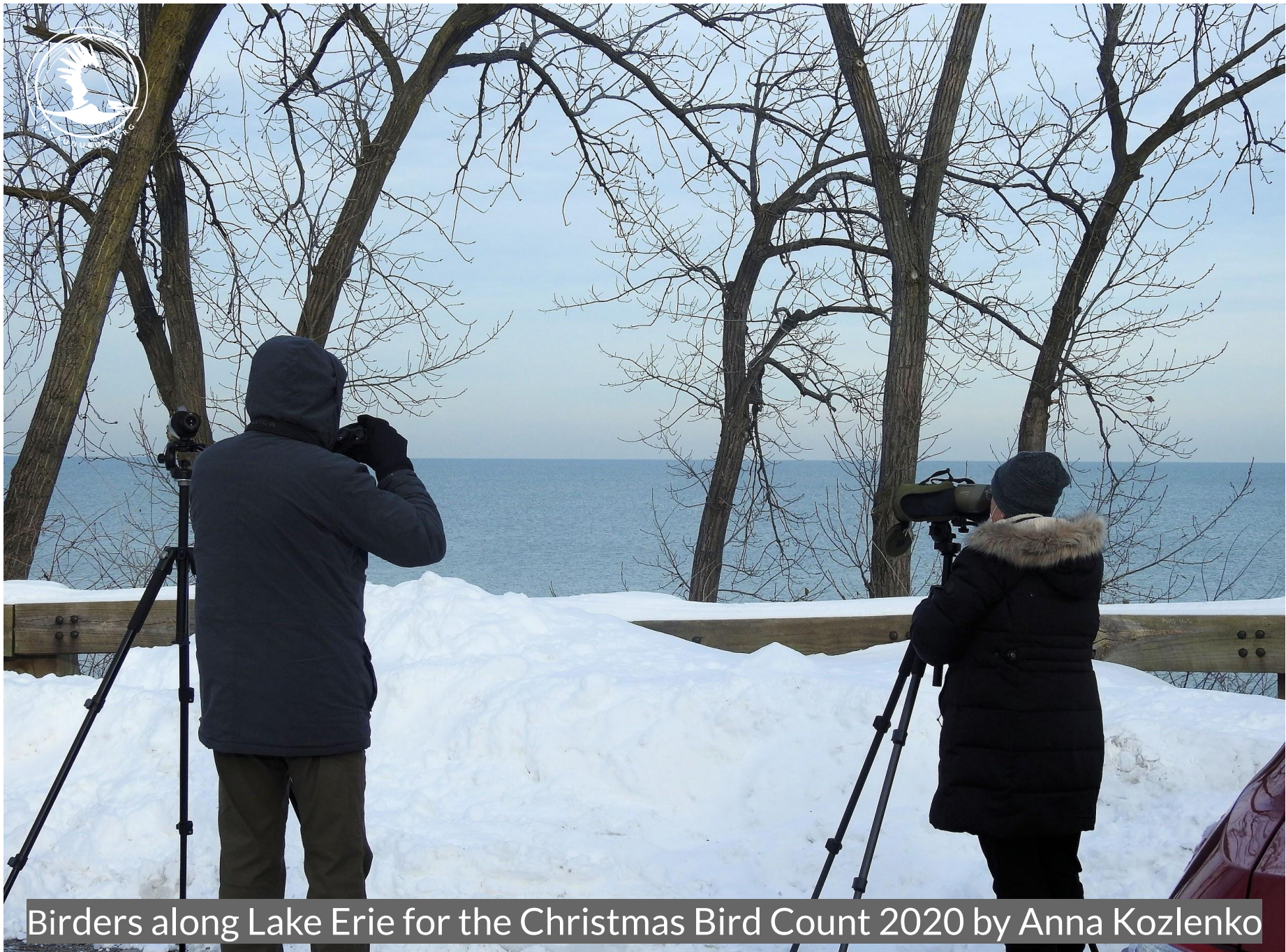
Birders along Lake Erie for the Christmas Bird Count 2020