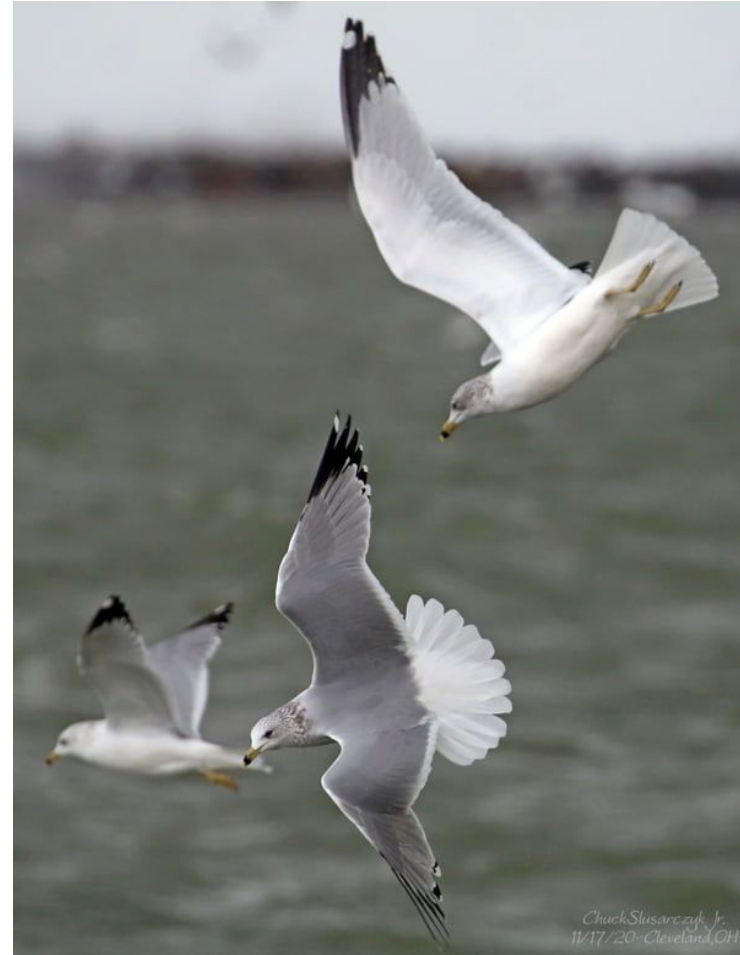
Ringed-billed Gulls