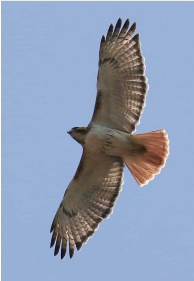
Red-tailed Hawk by Lenore Charnigo