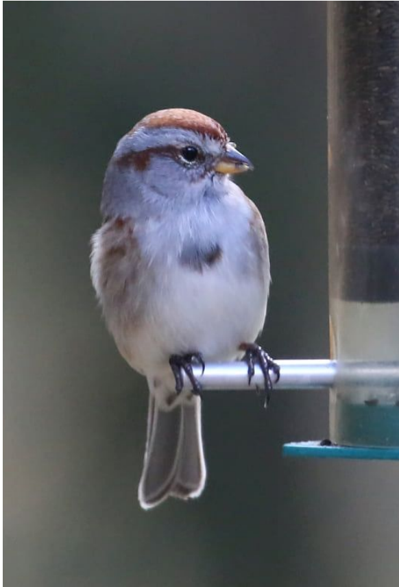
American Tree Sparrow by Chuck Slusarczyk, Jr.