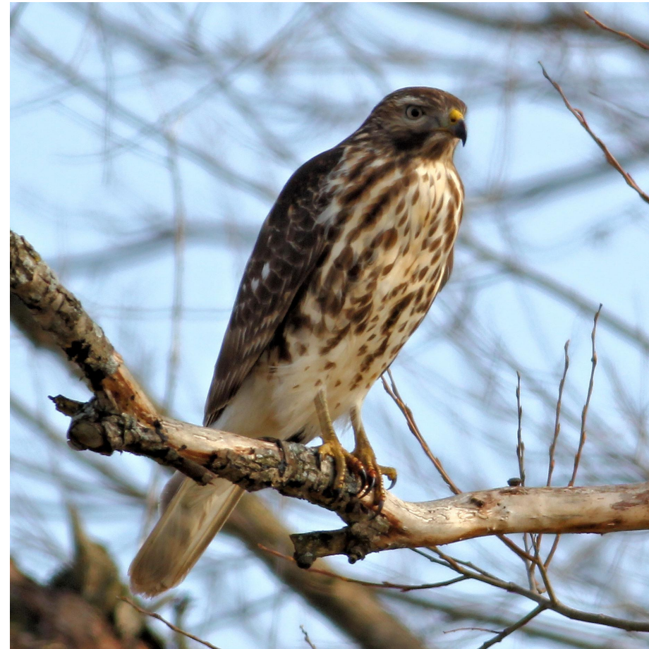
Red-shouldered Hawk by Tom Fishburn