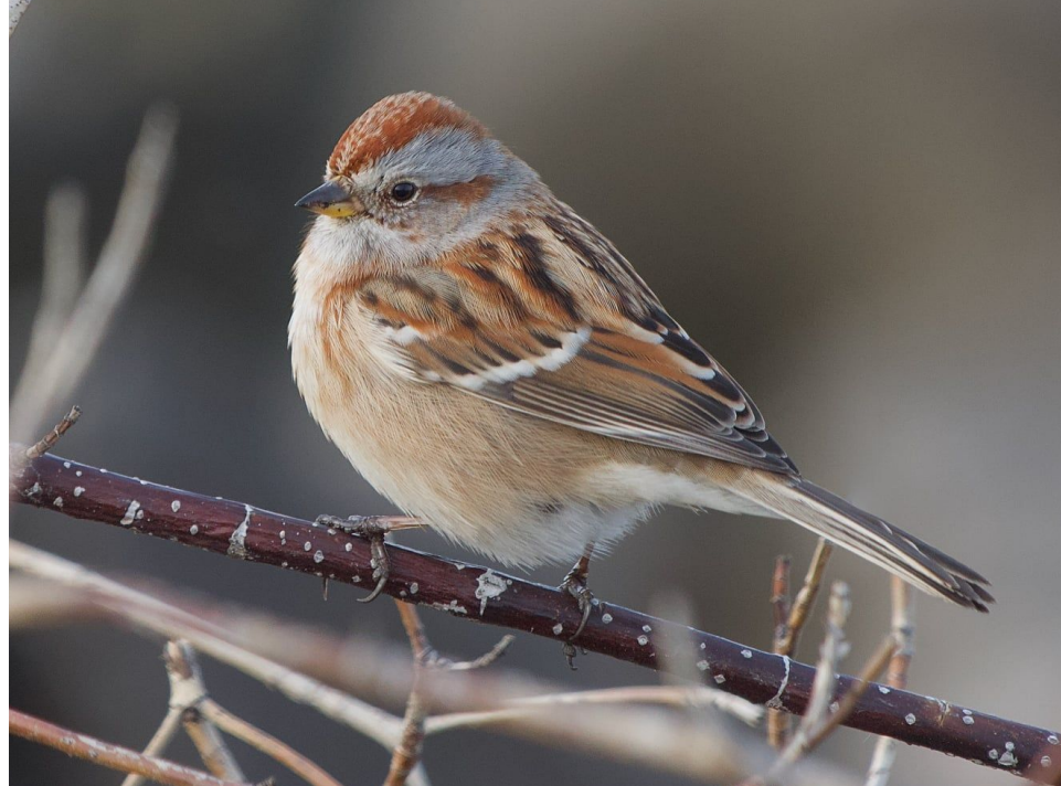
American Tree Sparrow