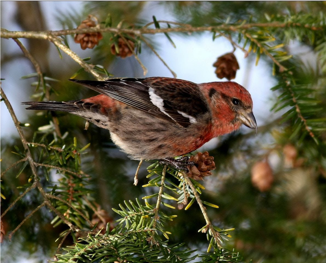
White-winged Crossbill by Tom Fishburn