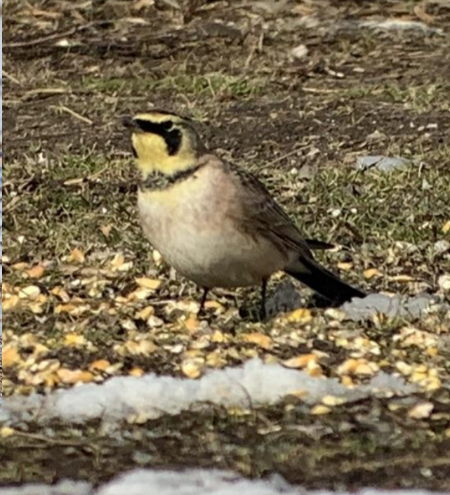
Horned Lark