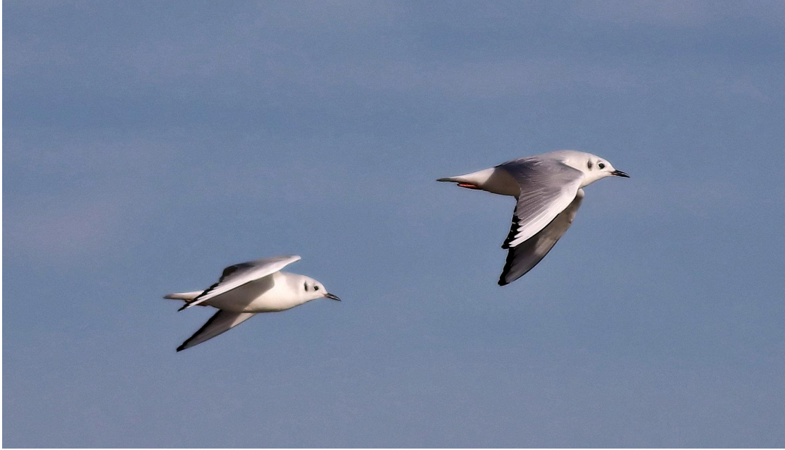
Bonaparte's Gull by Tom Fishburn