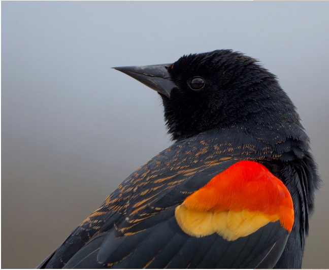
Above: Male Red-winged Blackbird