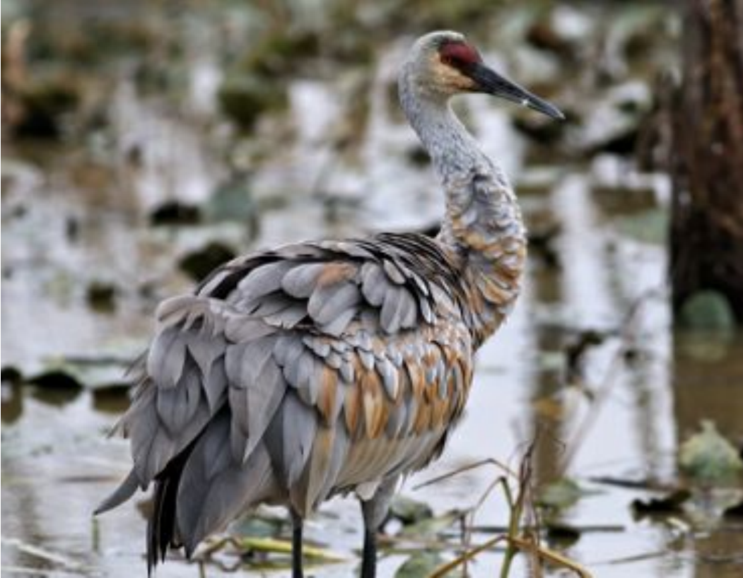
Sandhill Crane by Tom Fishburn