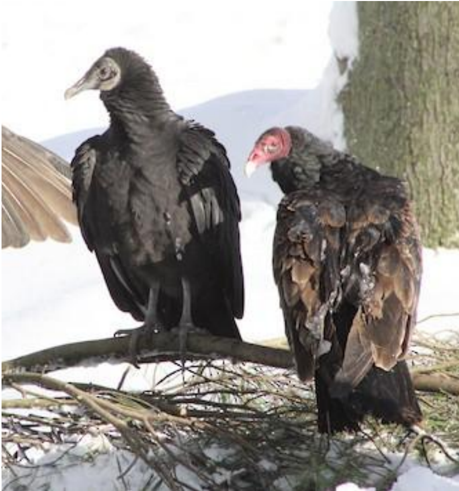
Black and Turkey Vultures by Jen Brumfield