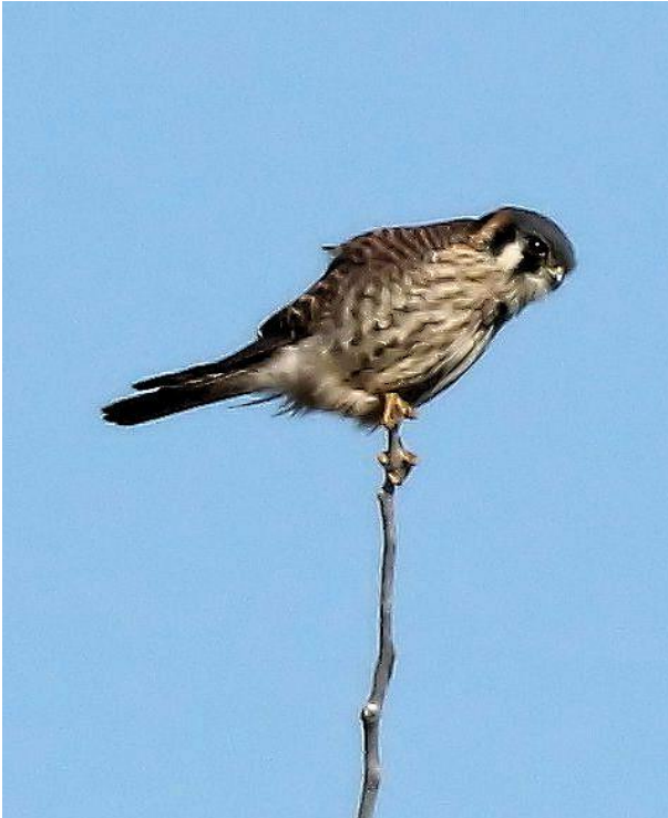
American Kestrel - female by Tom Fishburn