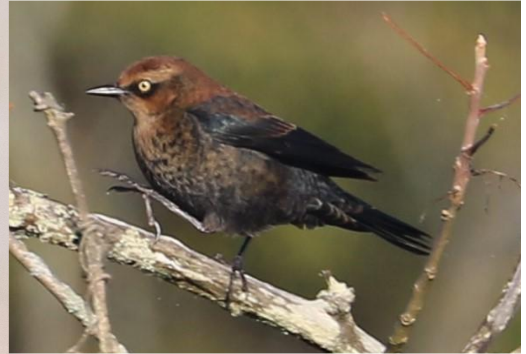
Rusty Blackbird