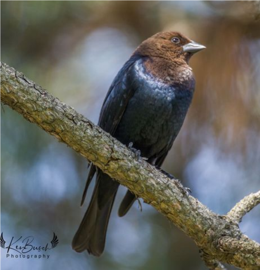
Brown-headed Cowbird