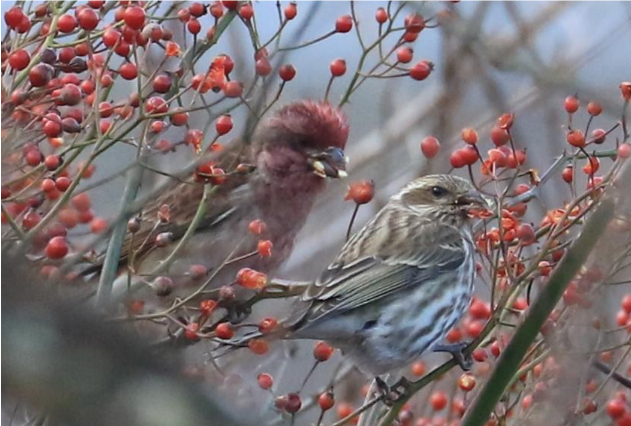
Above: Male and female Purple Finch