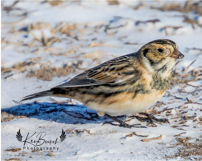
Lapland Longspur