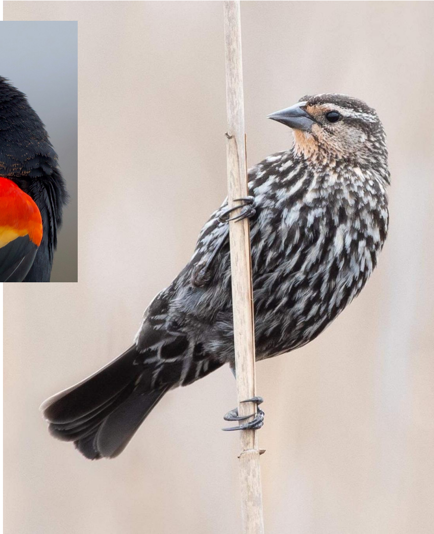
Right: Female Red-winged Blackbird by Kevin Perozeni