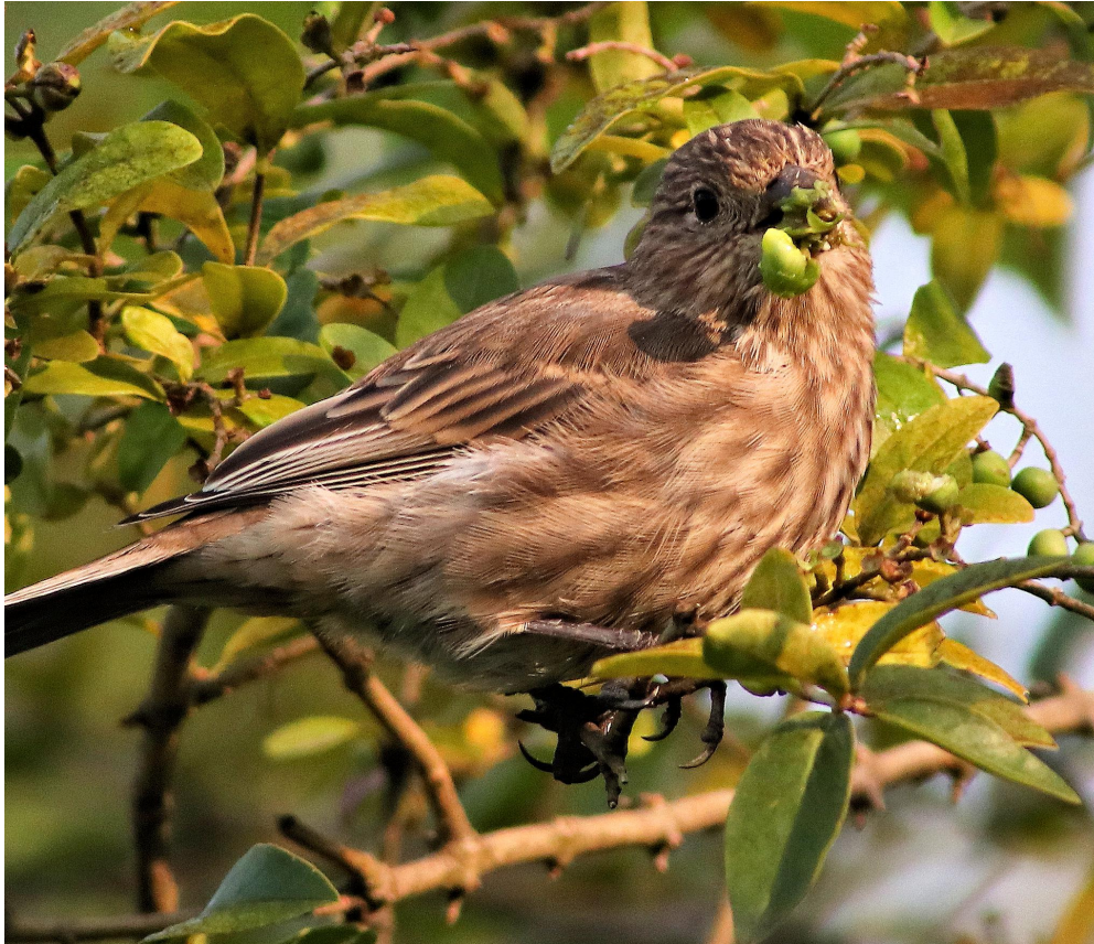
House Finch by Tom Fishburn