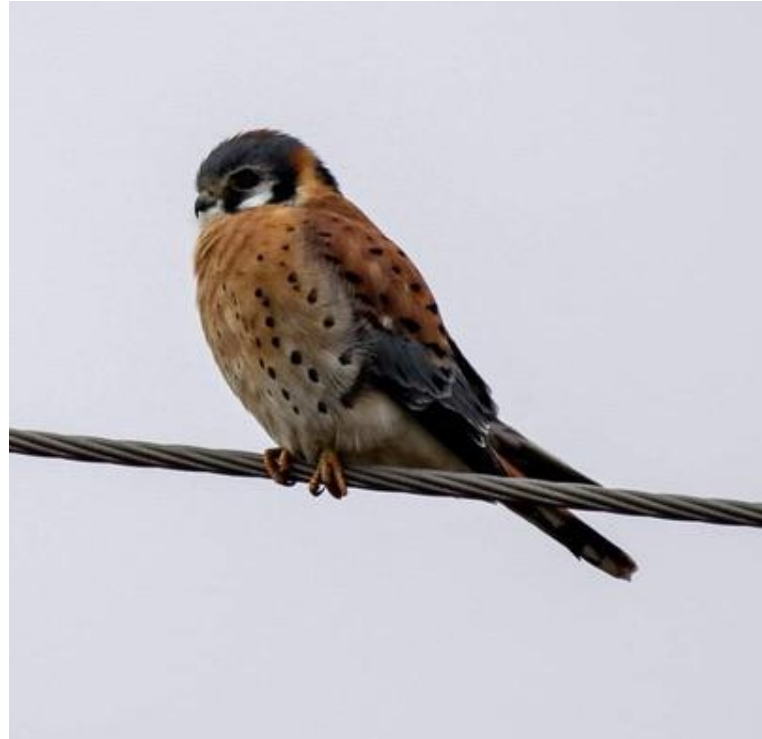
American Kestrel - male