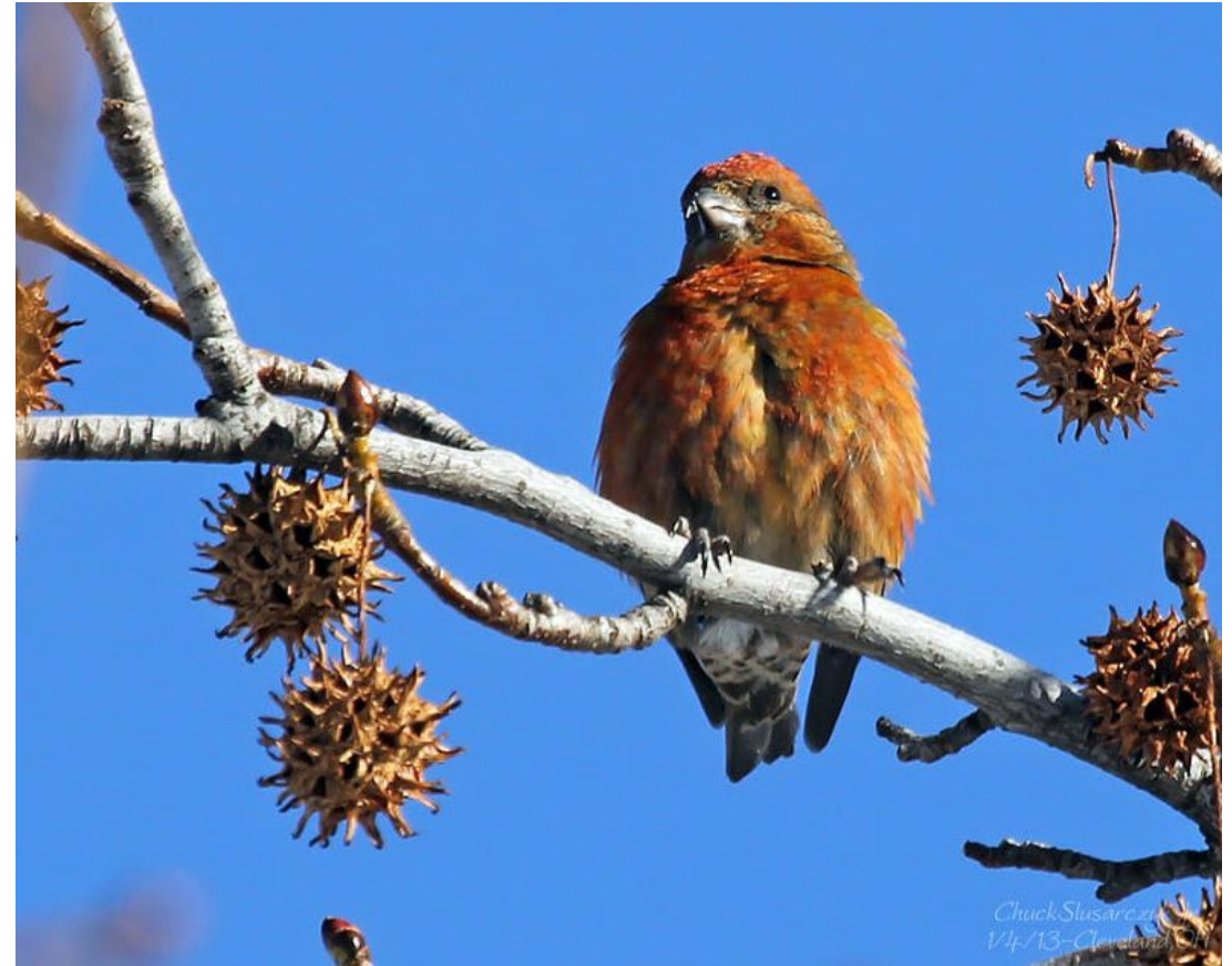
Red Crossbill by Chuck Slusarczyk, Jr.