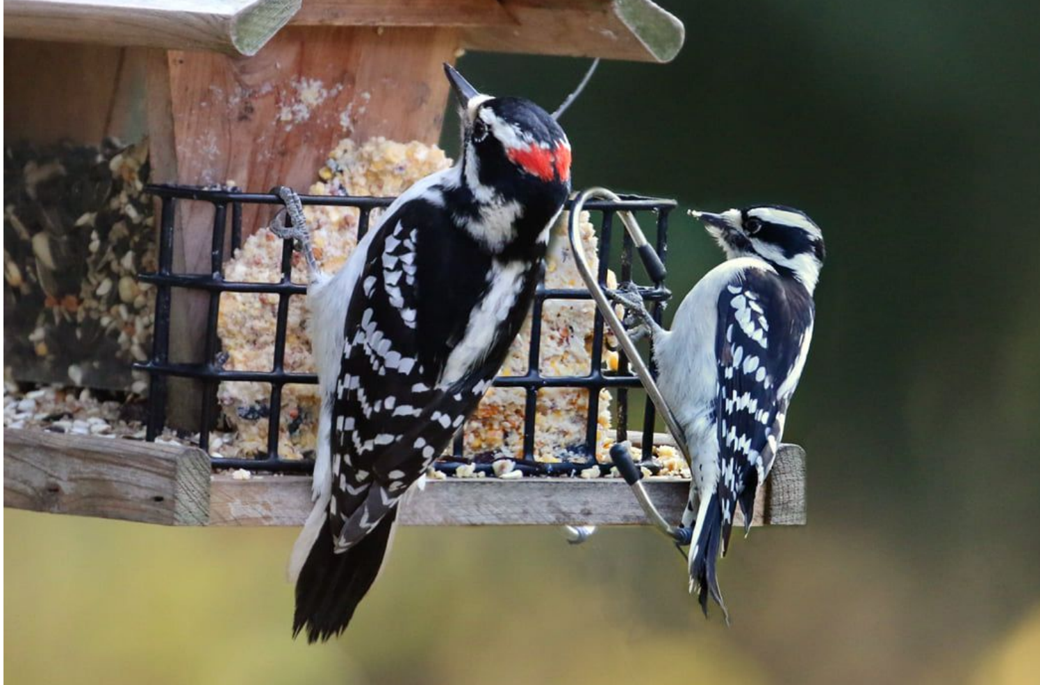
Hairy and Downy Woodpecker