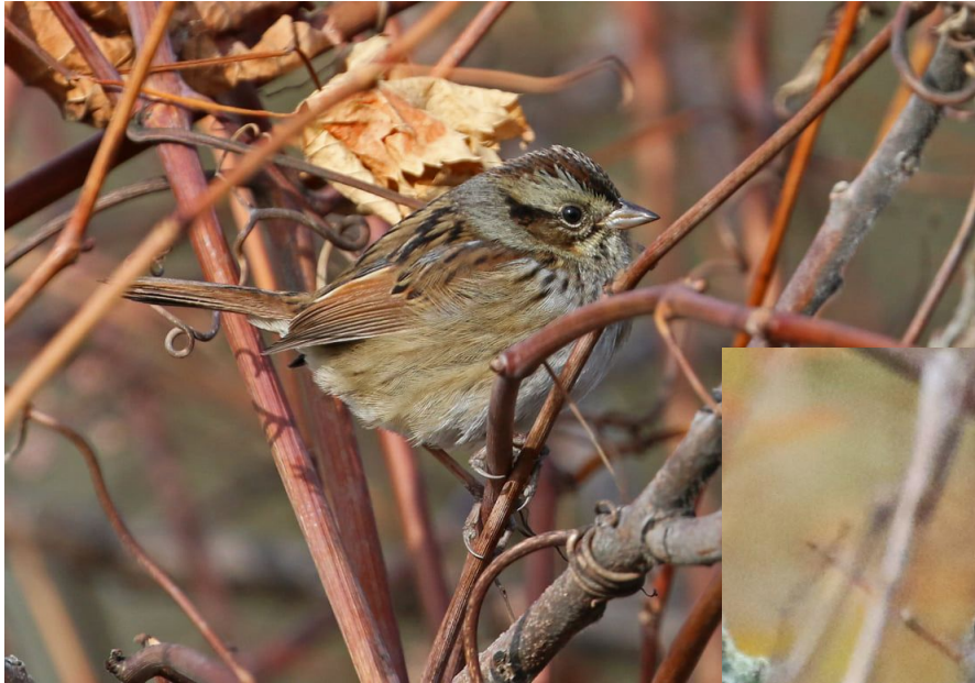
Above: Swamp Sparrow by Chuck Slusarczyk, Jr.