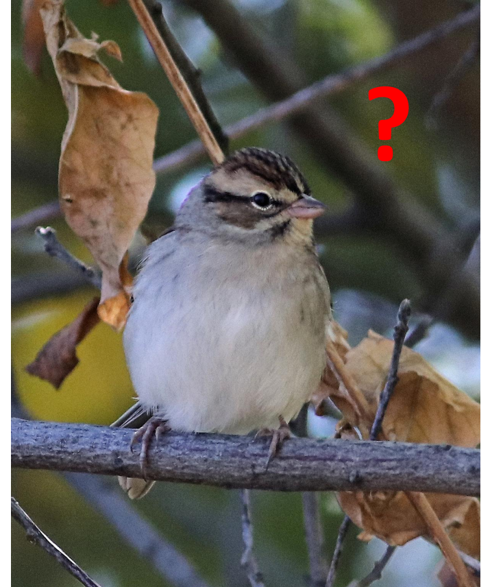
Chipping Sparrow by Tom Fishburn