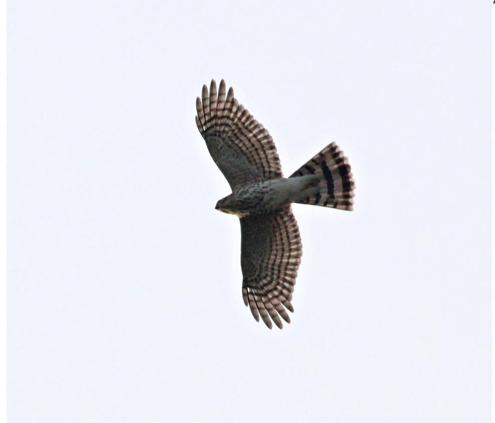
Juvenile Cooper's (left) and Sharp-shinned (right) Hawks