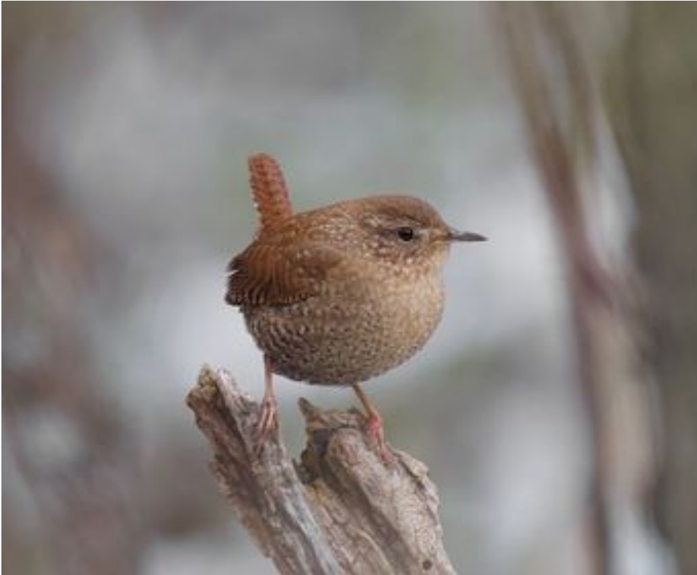
Winter Wren