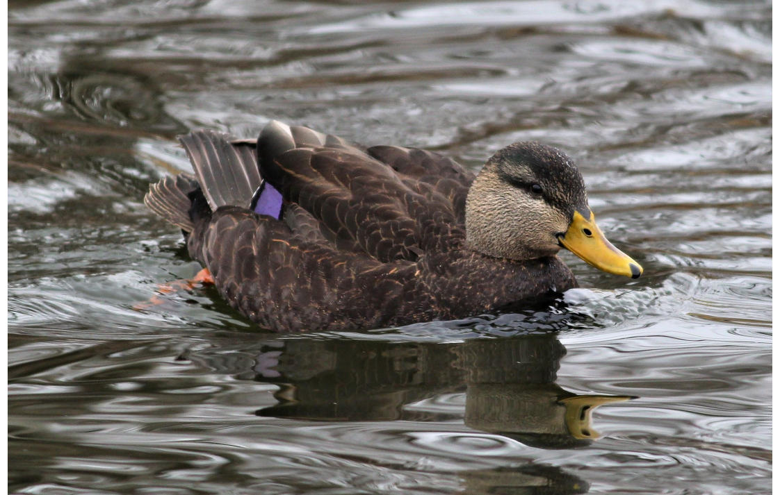
American Black Duck