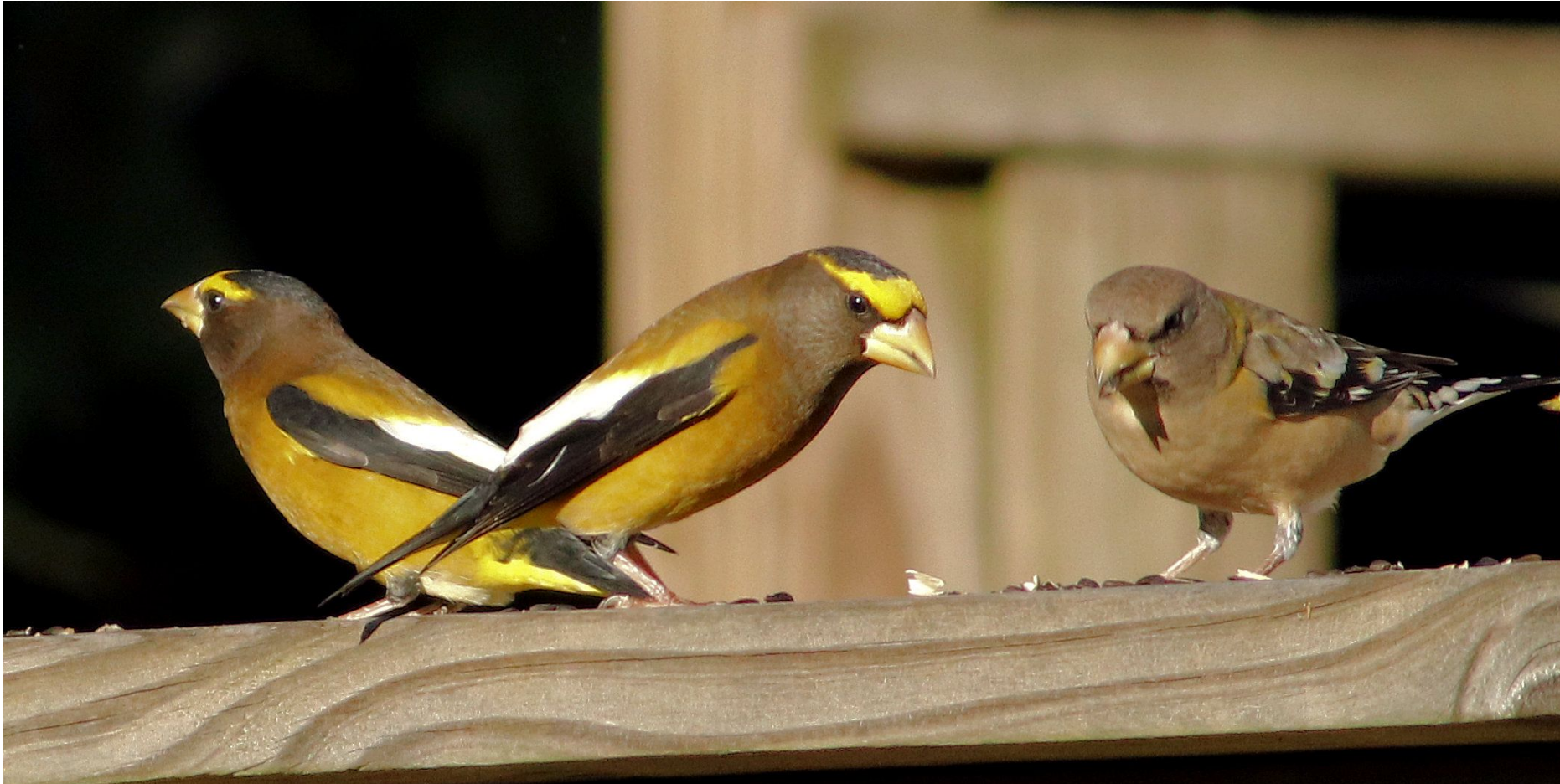
Evening Grosbeak by Tom Fishburn