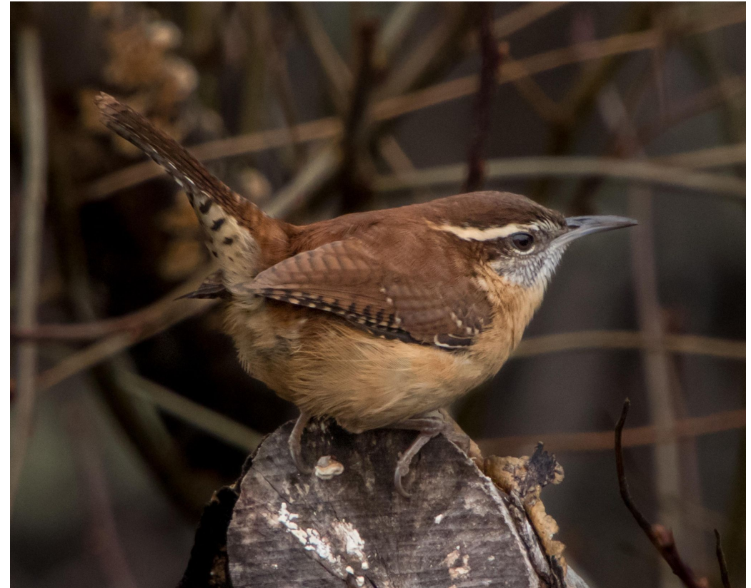
Carolina Wren