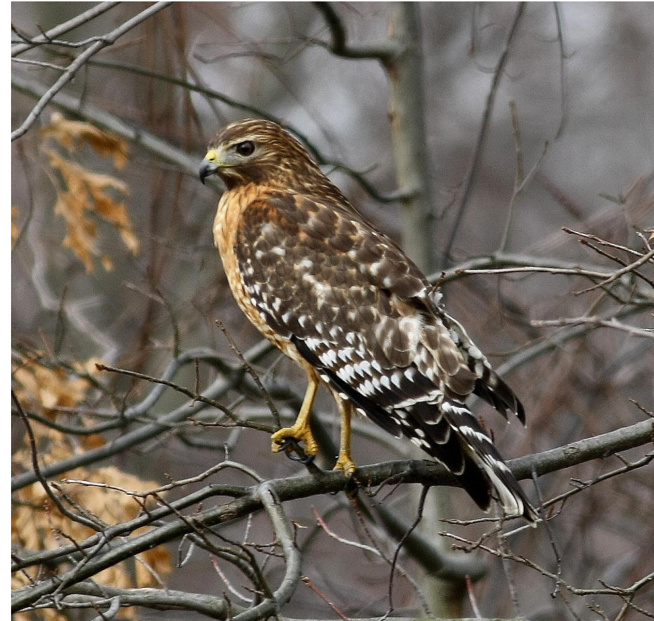
Red-shouldered Hawk by Tom Fishburn