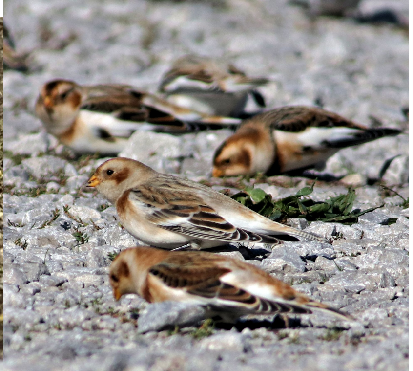
Snow Buntings by Tom Fishburn