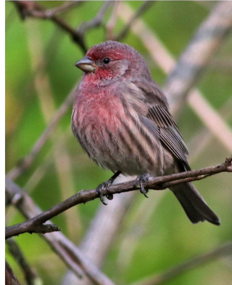
Left: Male House Finch