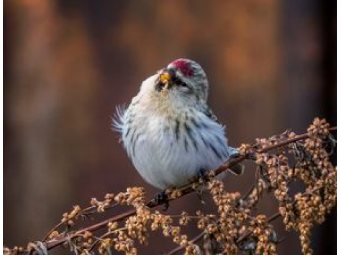
Hoary Redpoll