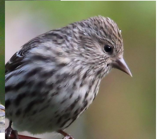
Pine Siskin (inset) by Tom Fishburn