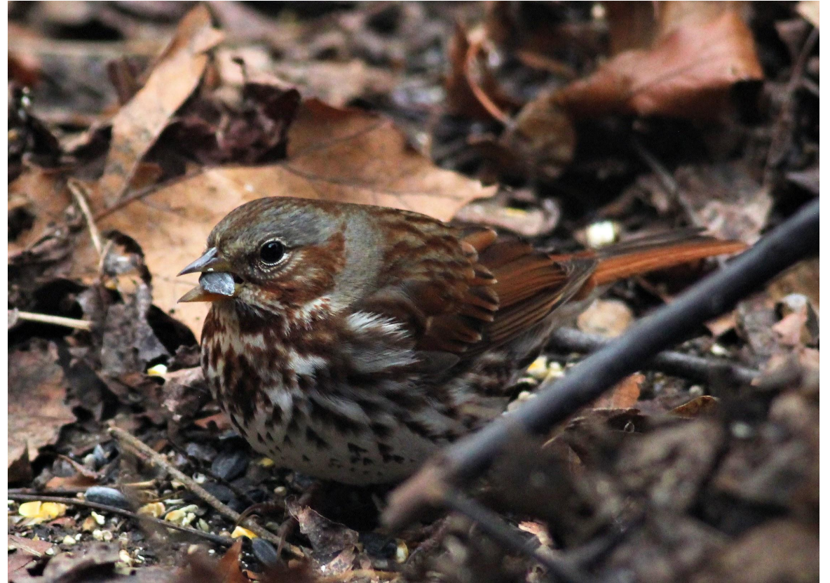
Song (left) and Fox (right) Sparrows by Tom Fishburn