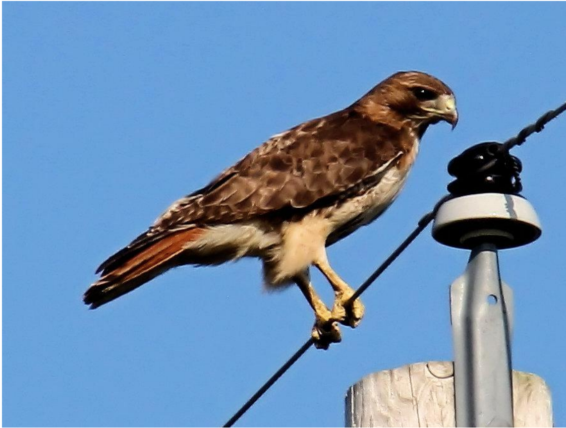
Red-tailed Hawk by Tom Fishburn