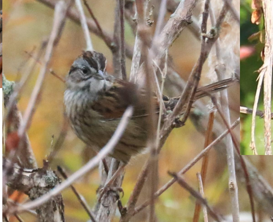
Right: Swamp Sparrow