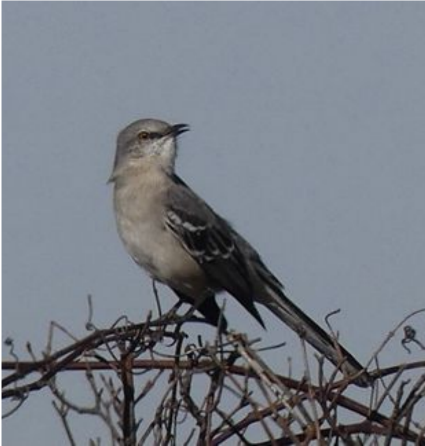
Northern Mockingbird