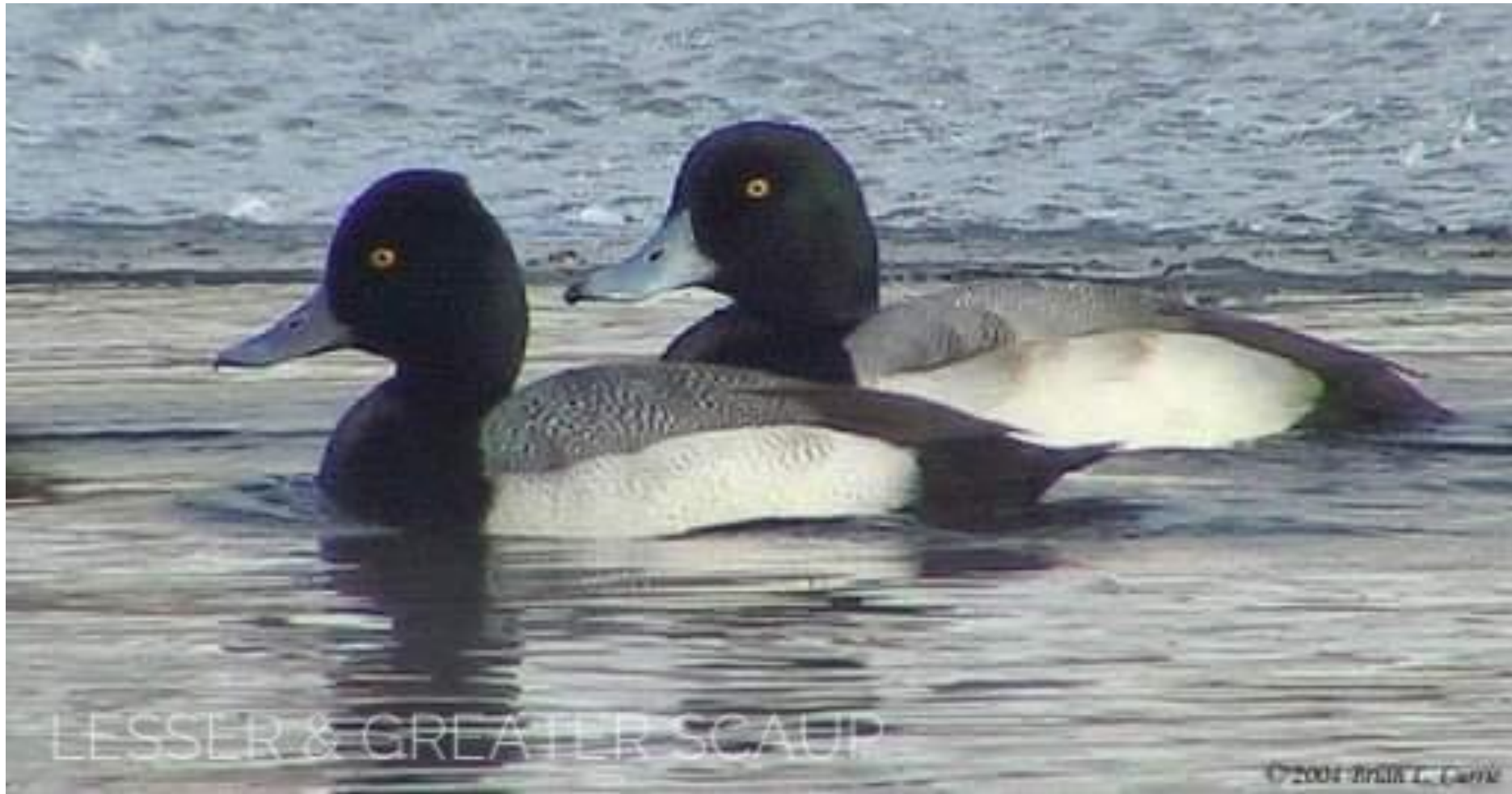
Lesser Scaup and Greater Scaup