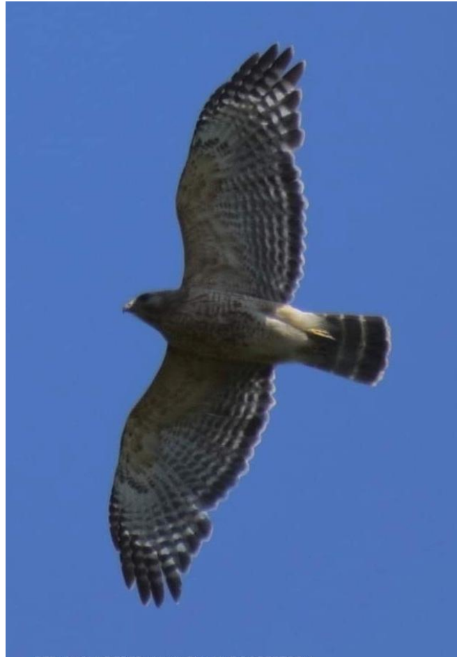
Red-shouldered Hawk