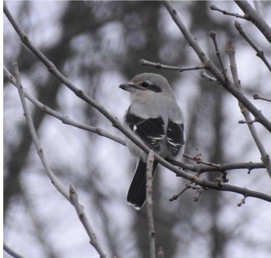
Northern Shrike