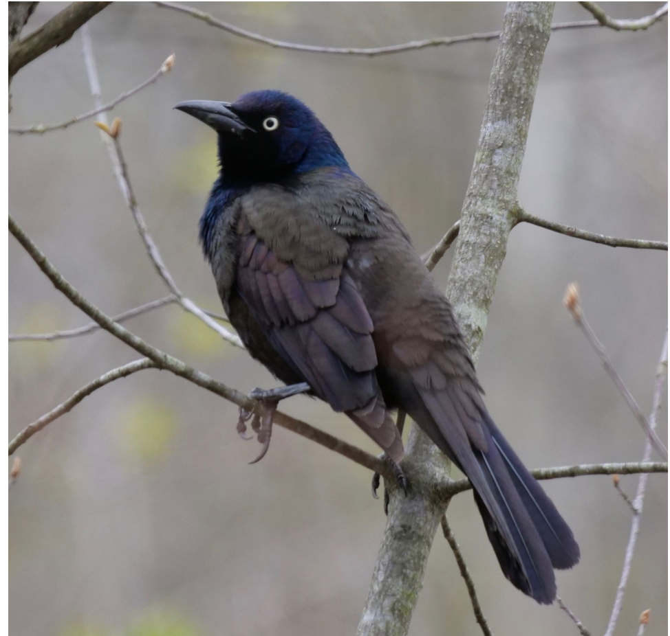
Common Grackle by Gautam Apte