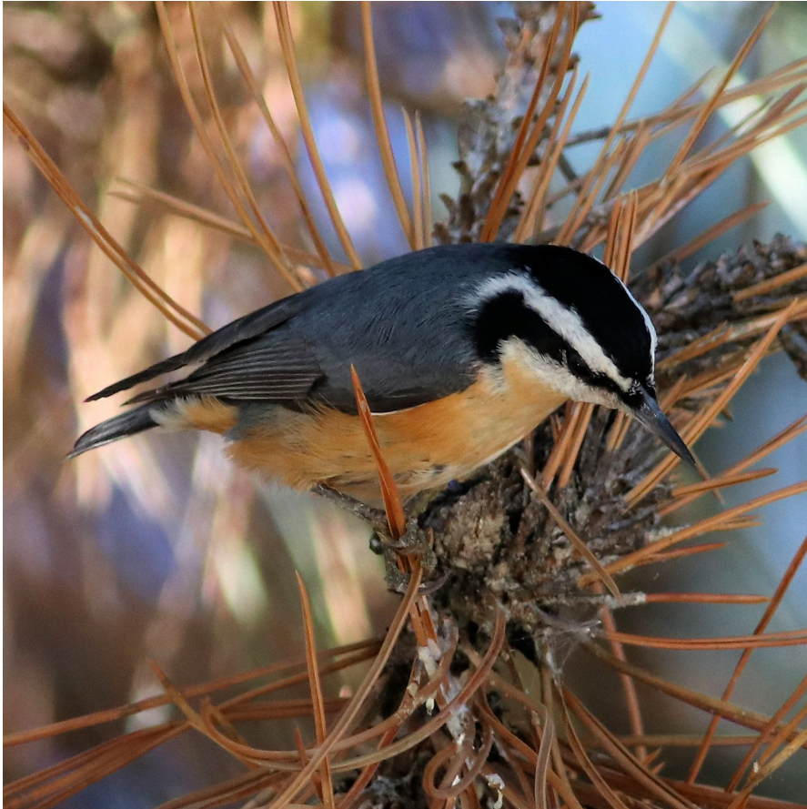
Red-breasted Nuthatch by Tom Fishburn