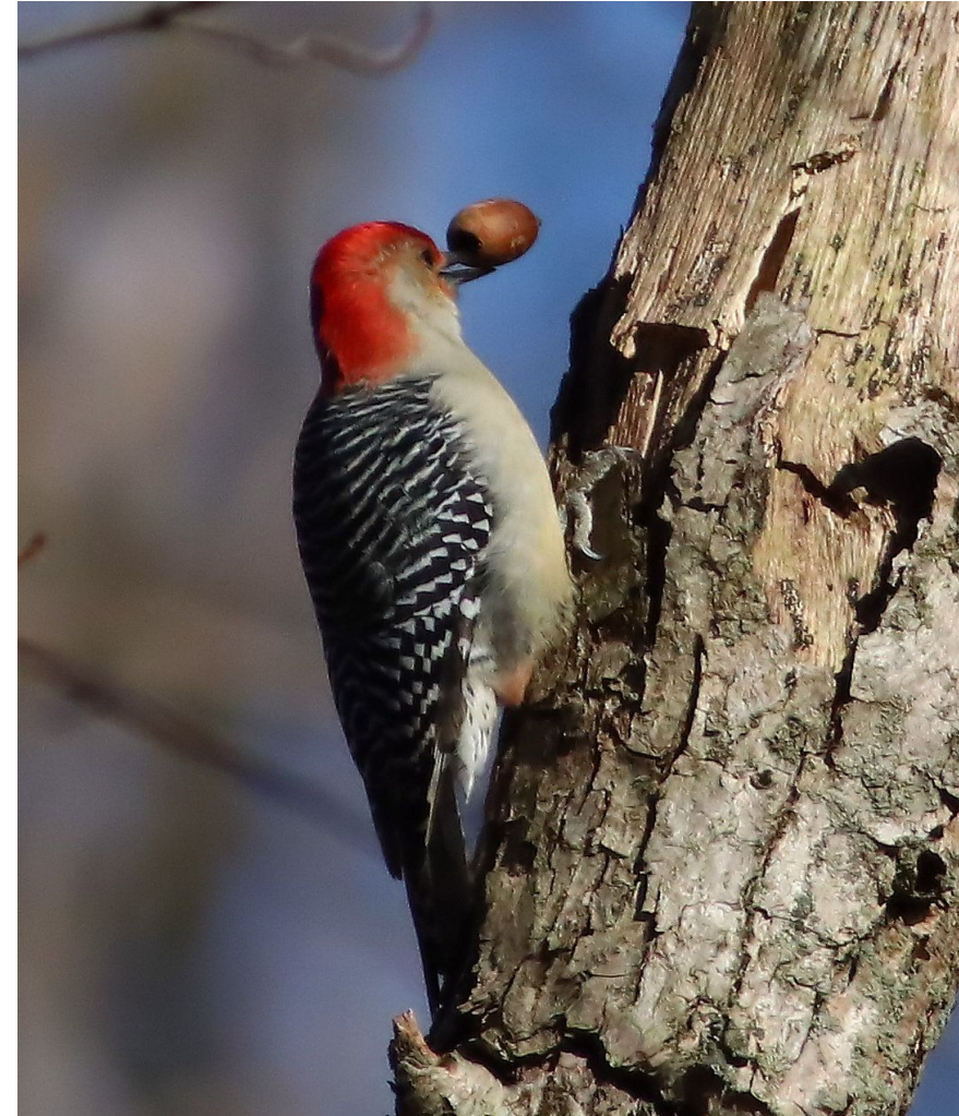
Northern Flicker and Red-bellied Woodpecker by Tom Fishburn