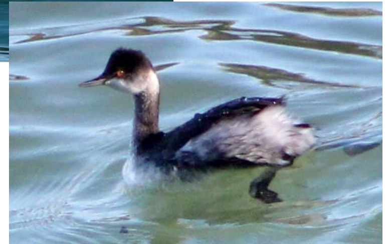
Right: Eared Grebe