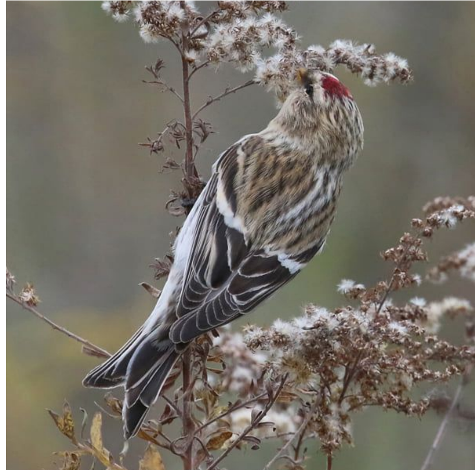
Left: Common Redpoll back view. Right: Hoary Redpoll back view