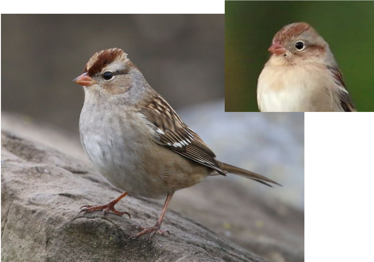
Immature White-crowned Sparrow and inset of Field Sparrow by Chuck Slusarczyk, Jr.