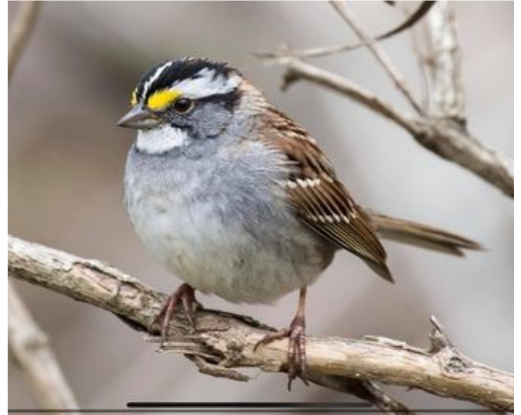
White-throated Sparrow by Phil Sisto