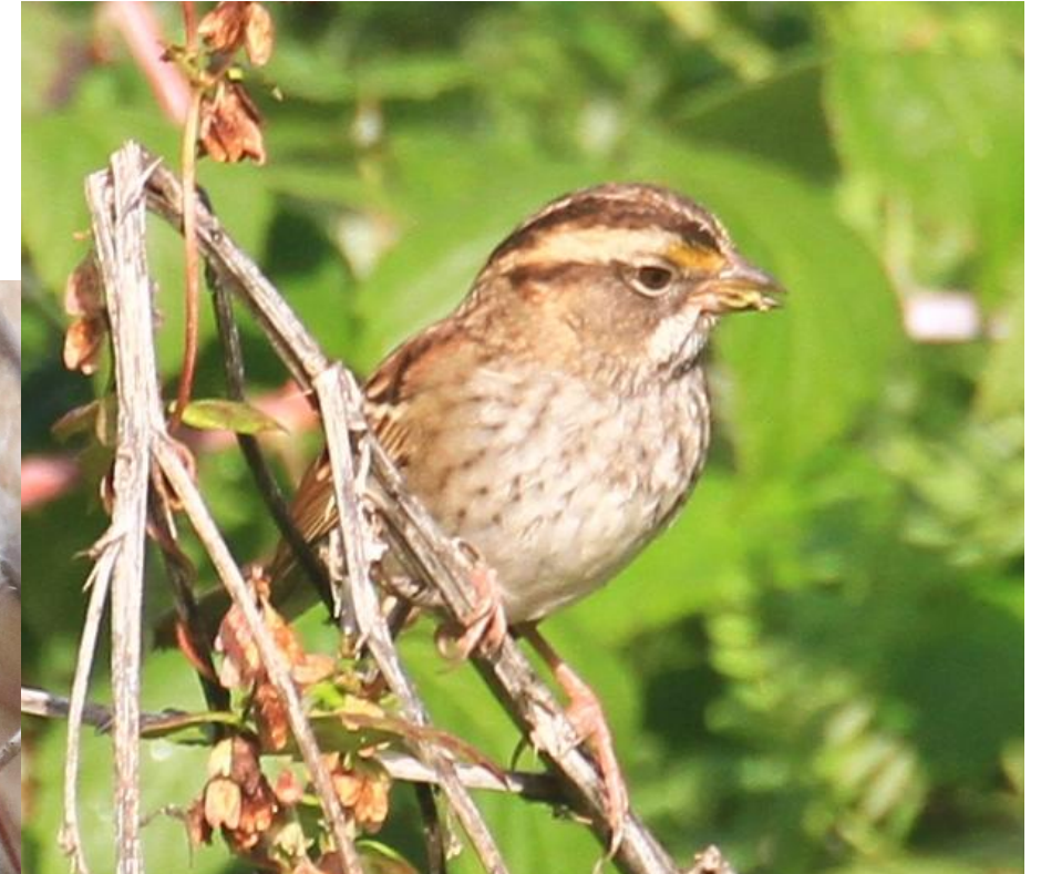
Above: White-throated Sparrow