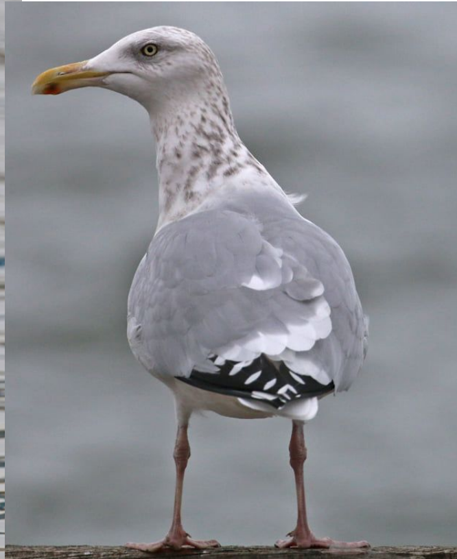
Above: First winter and adult in winter Herring Gulls