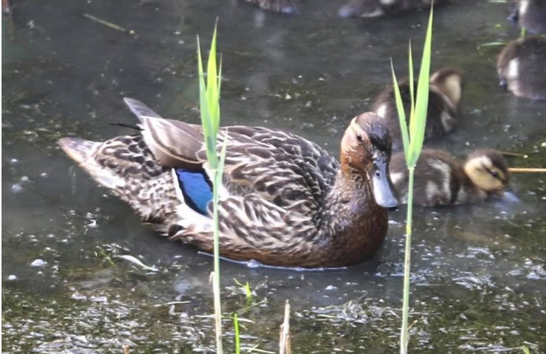
Female Mallard