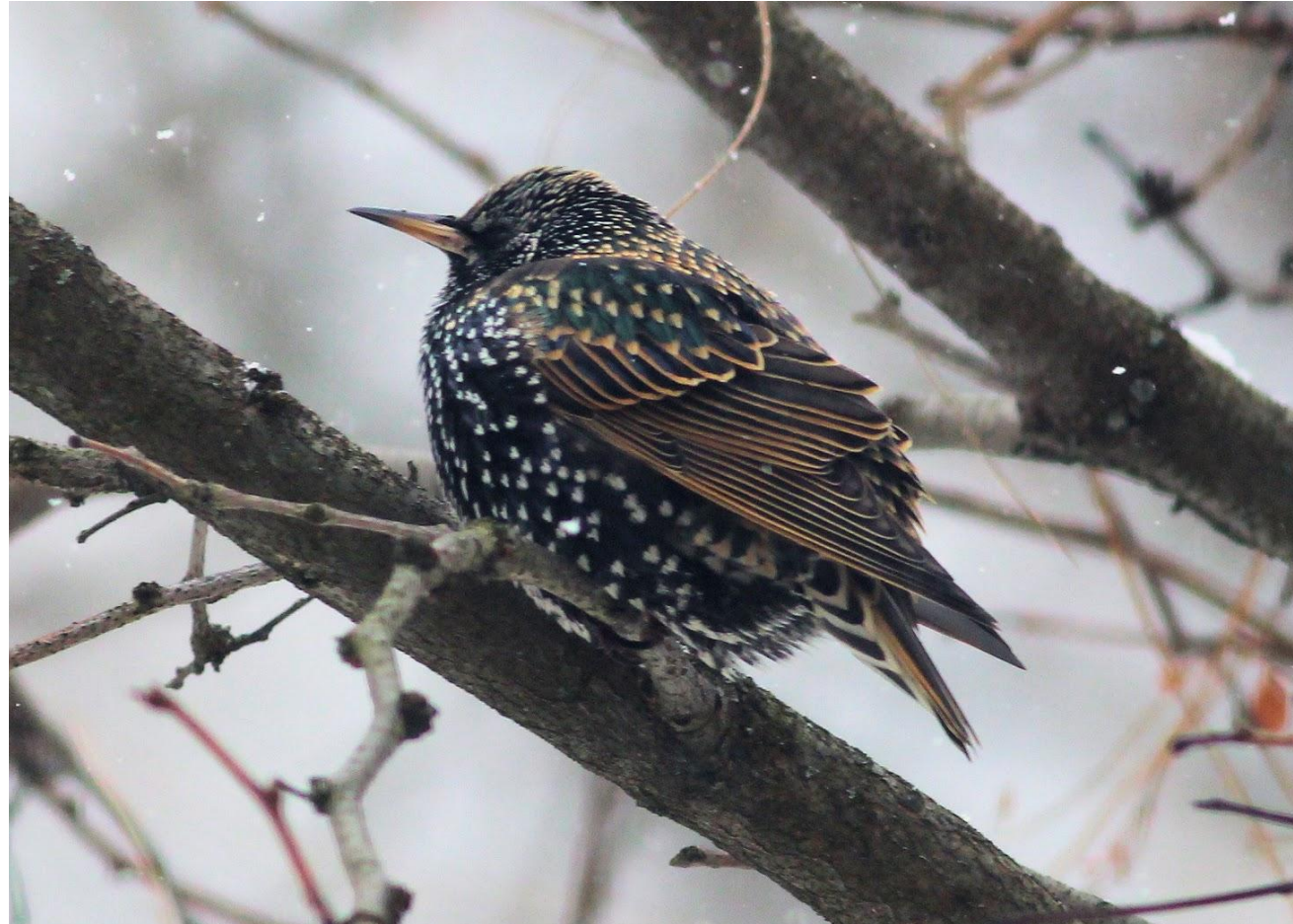
European Starling by Tom Fishburn