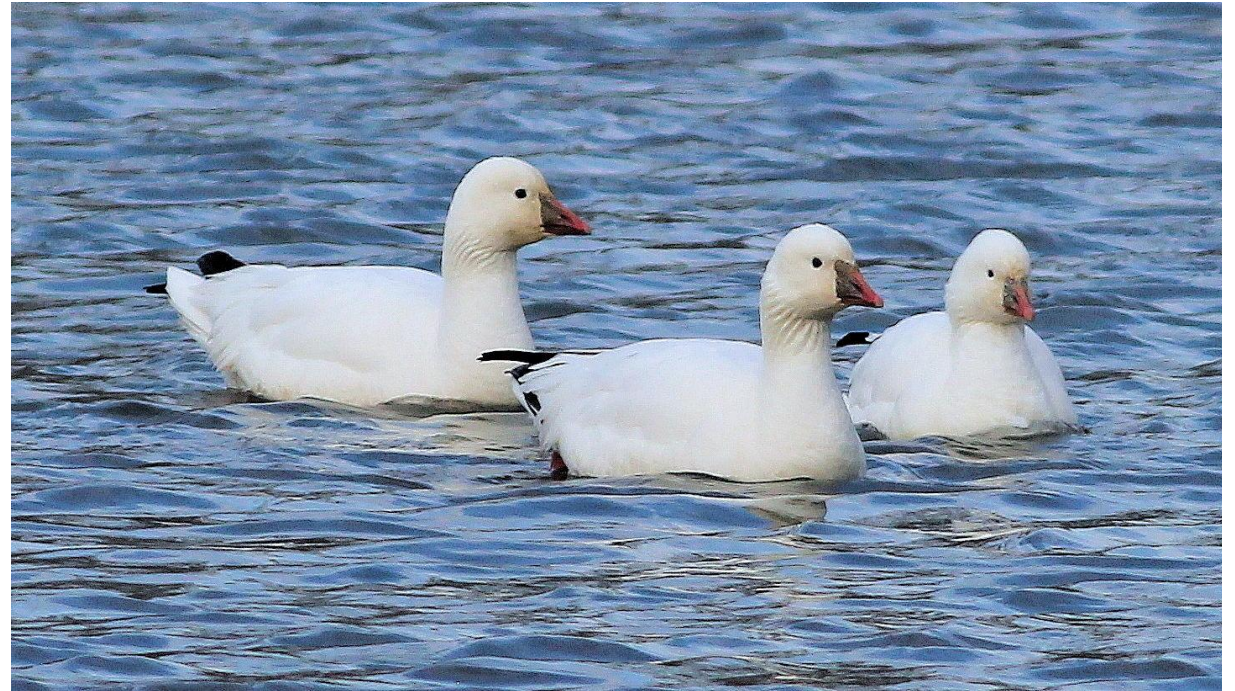
Snow and Ross's Goose by Tom Fishburn