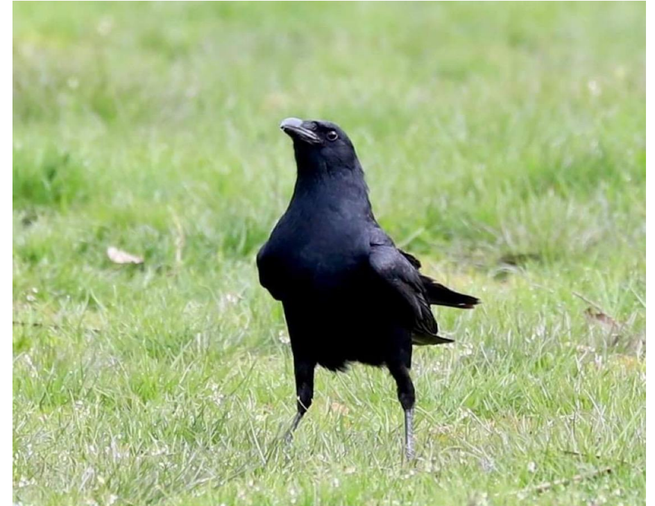
Fish Crow by Lenore Charnigo