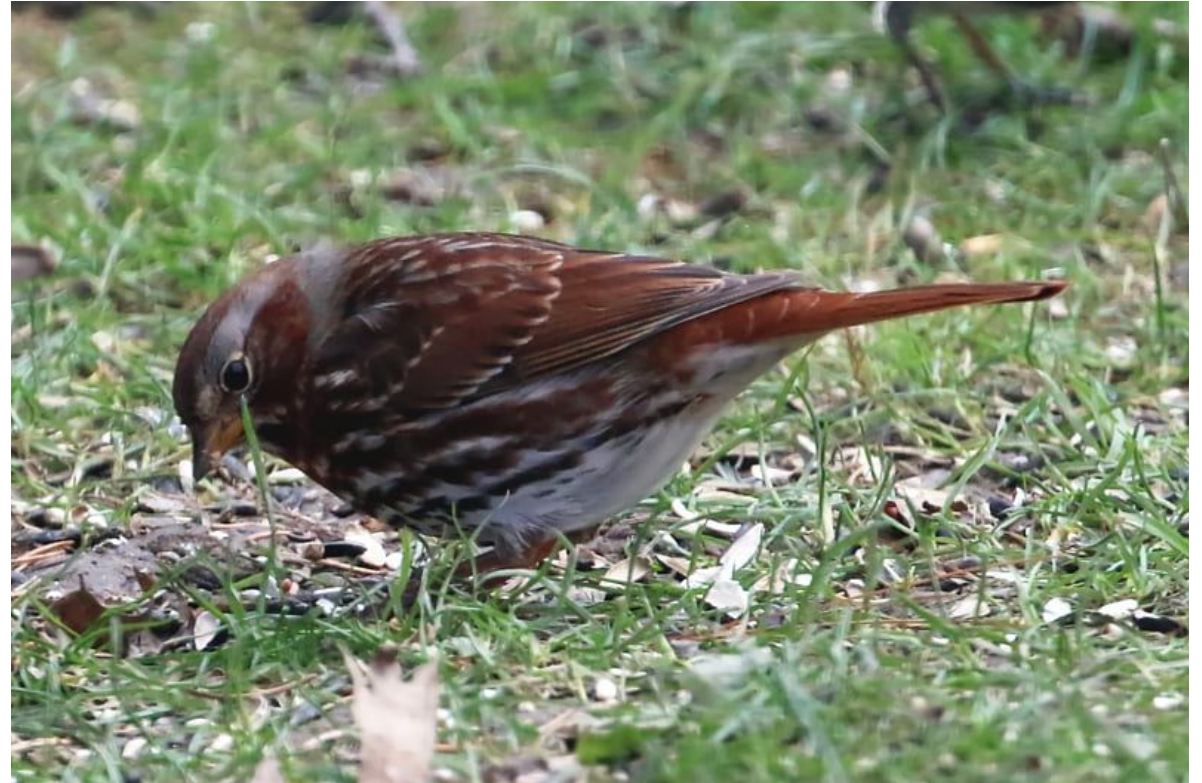
Fox Sparrow by Chuck Slusarczyk, Jr.