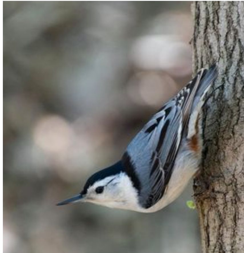
White-breasted Nuthatch