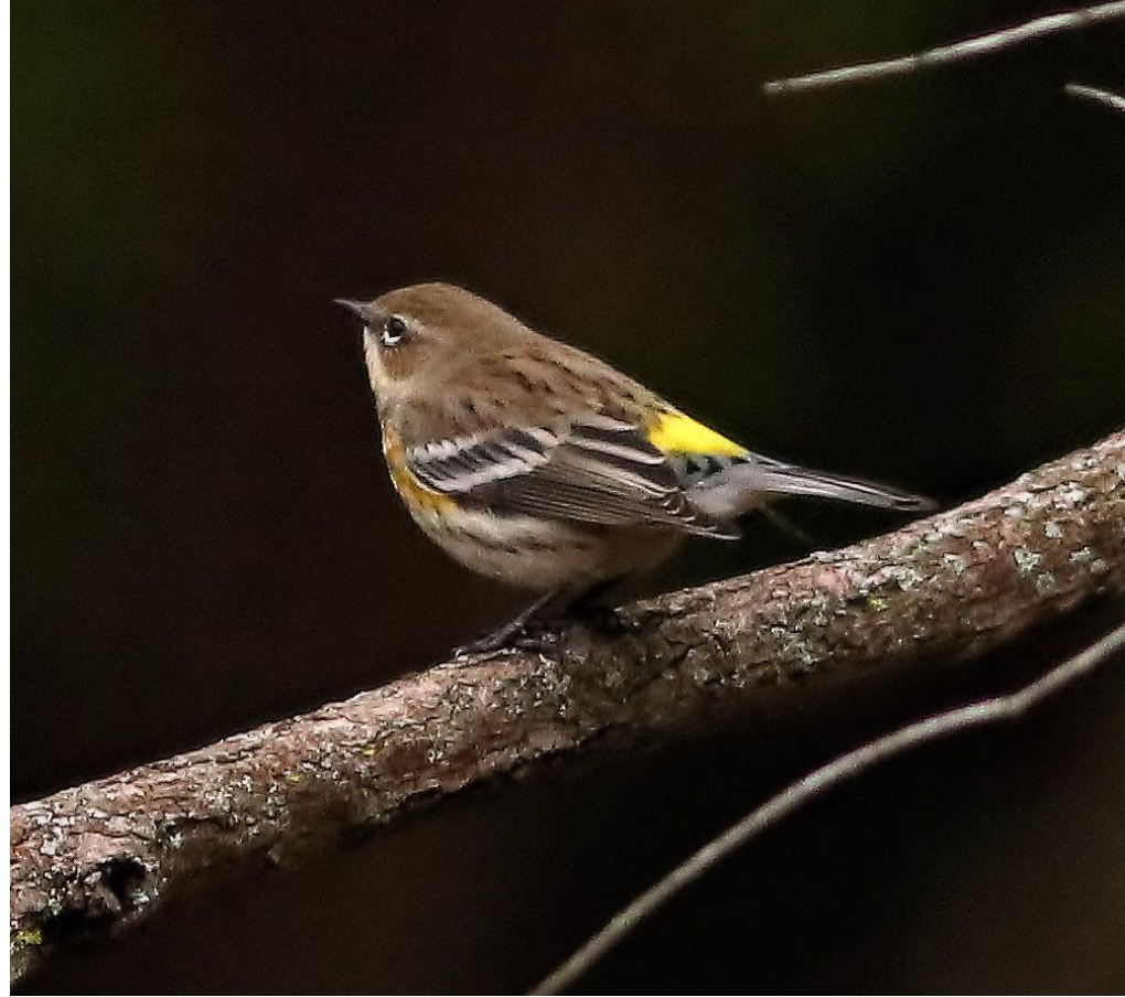
Yellow-rumped Warblers by Tom Fishburn