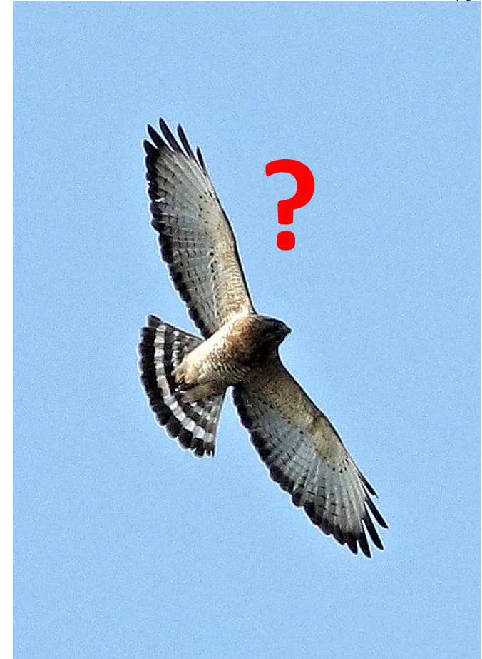
Broad-winged Hawk by Tom Fishburn