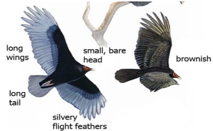
Turkey and Black Vultures in flight from Sibley, 2nd Edition