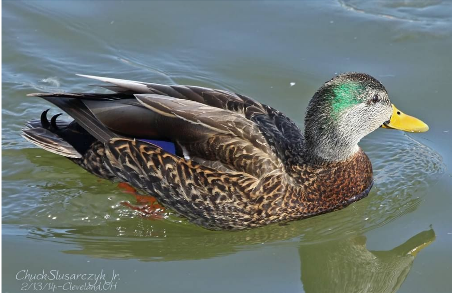
American Black Duck/Mallard by Chuck Slusarczyk, Jr.