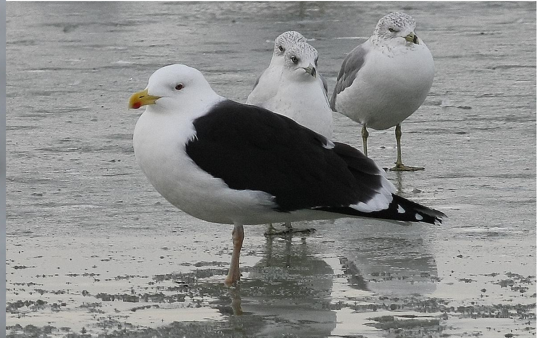
Great Black-backed Gull by Tom Fishburn