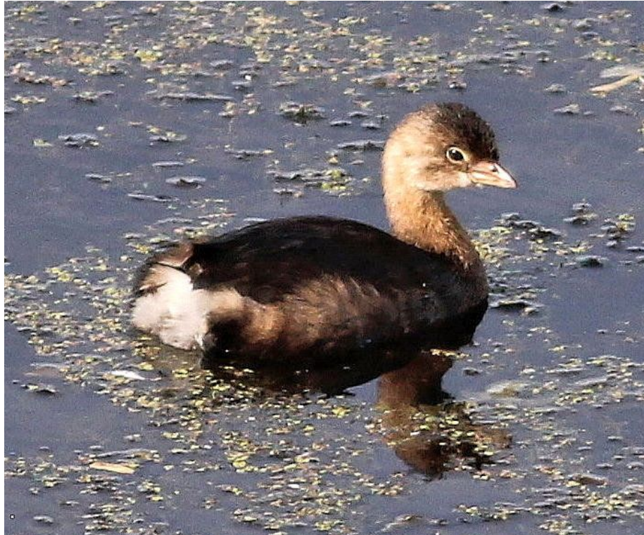
Pied-billed Grebe