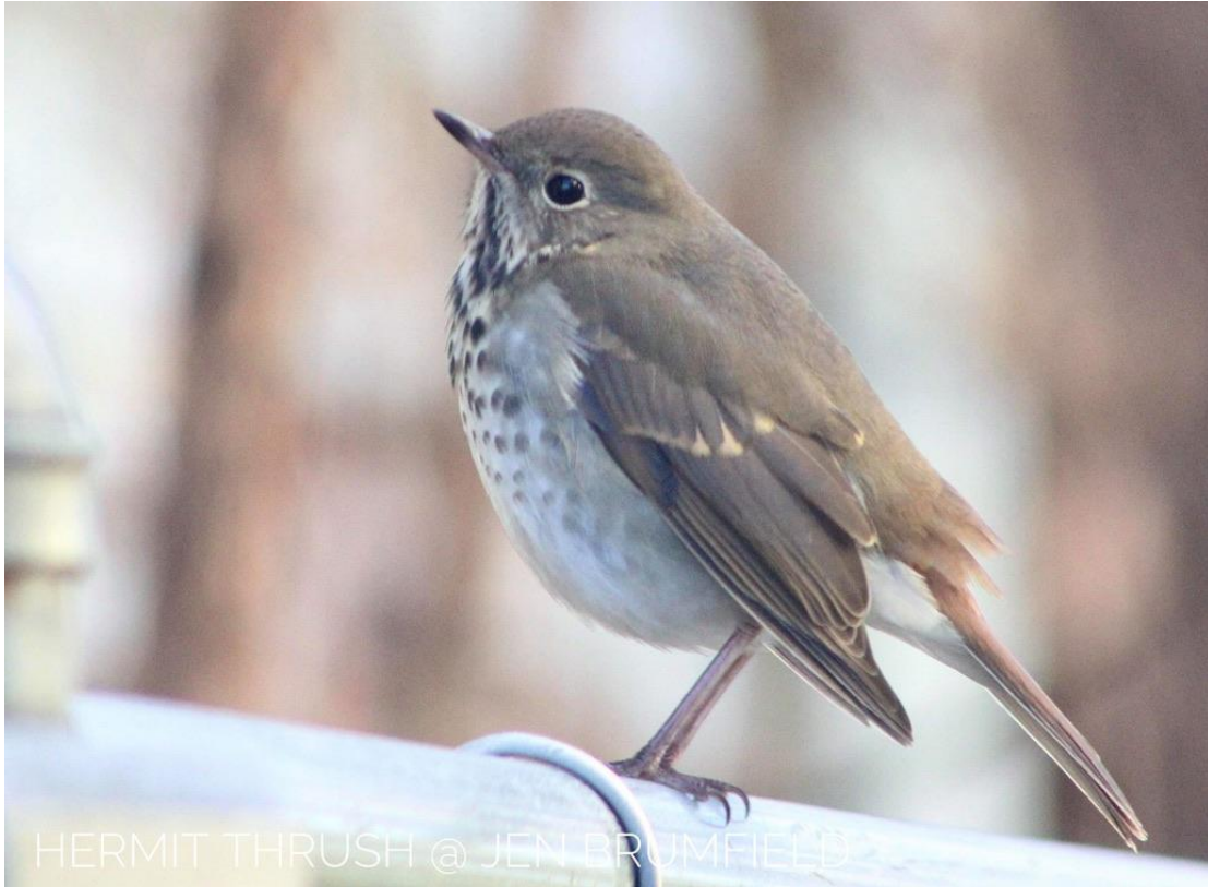
Hermit Thrush by Jen Brumfield