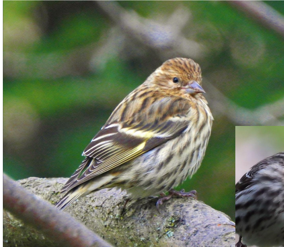
Pine Siskin above