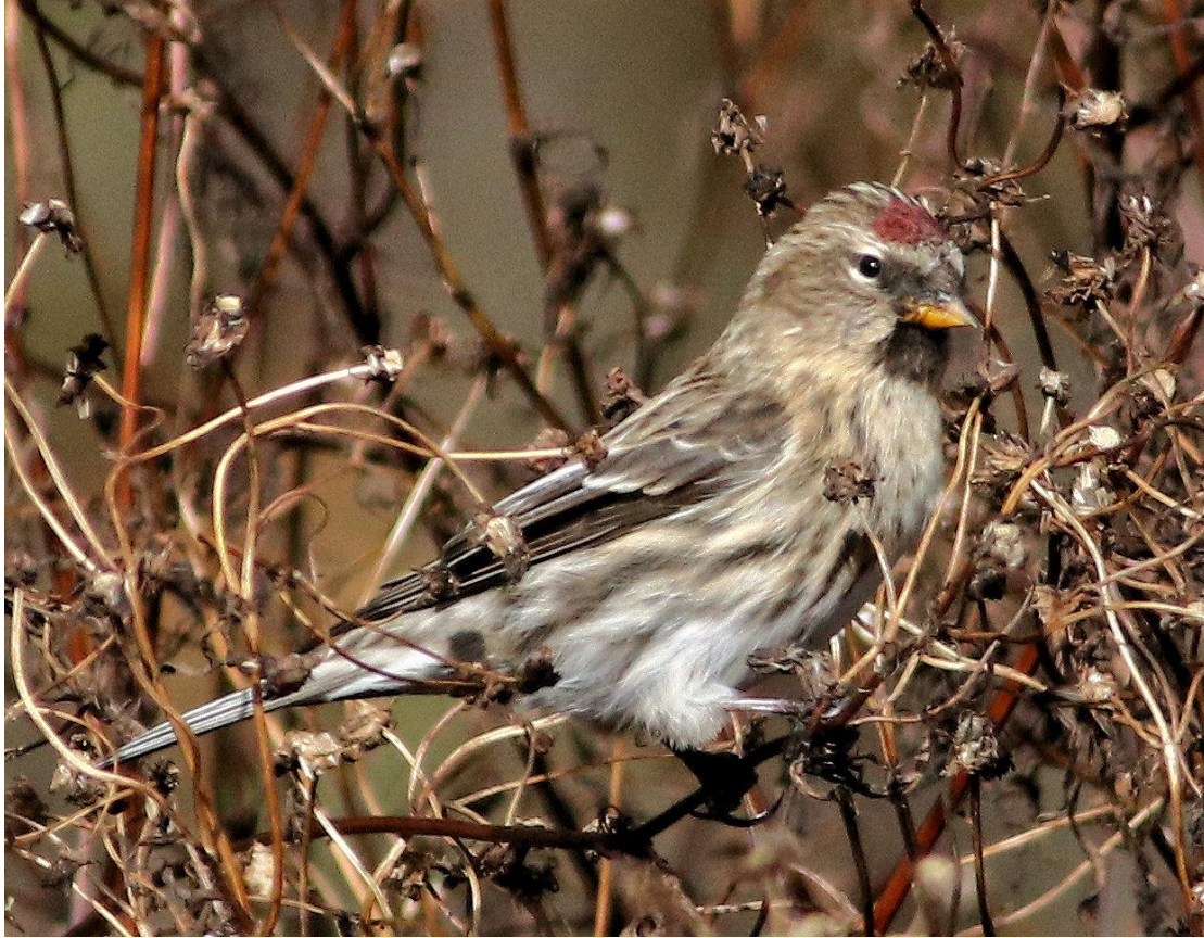
Common Redpoll by Tom Fishburn