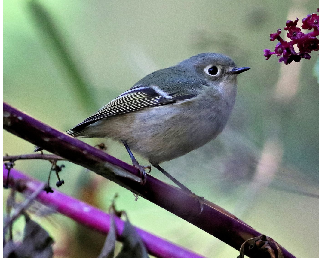
Golden-crowned and Ruby-crowned Kinglets by Tom Fishburn