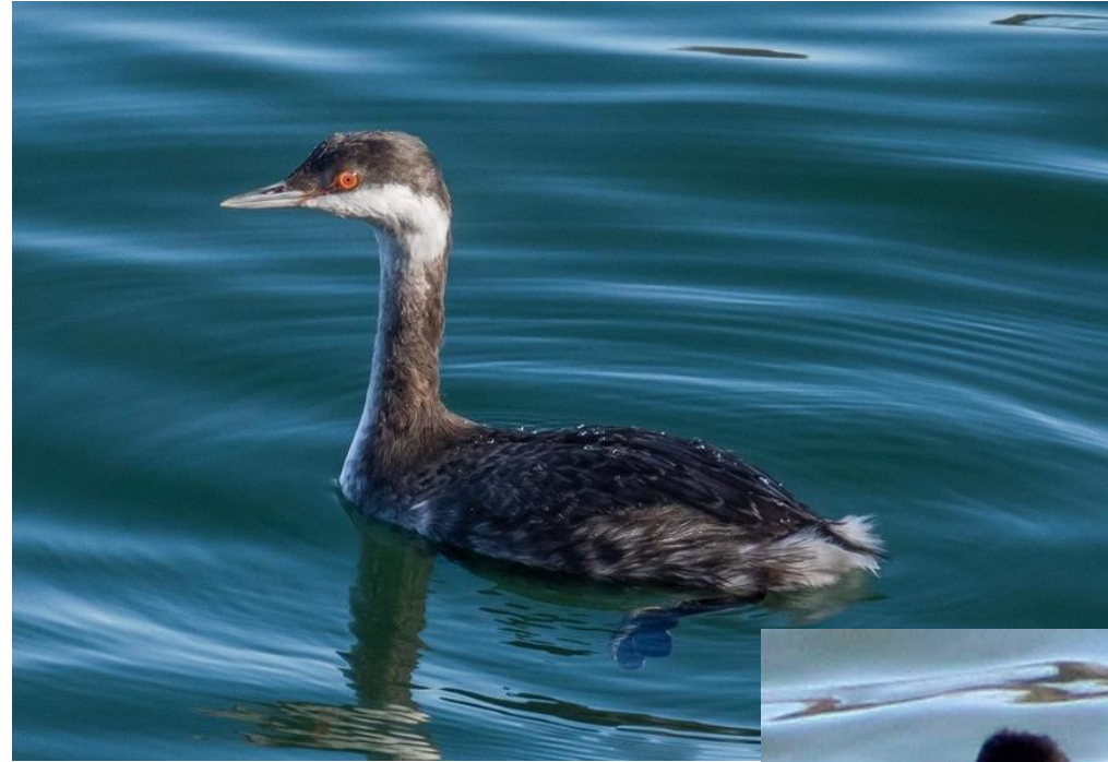
Above: Horned Grebe