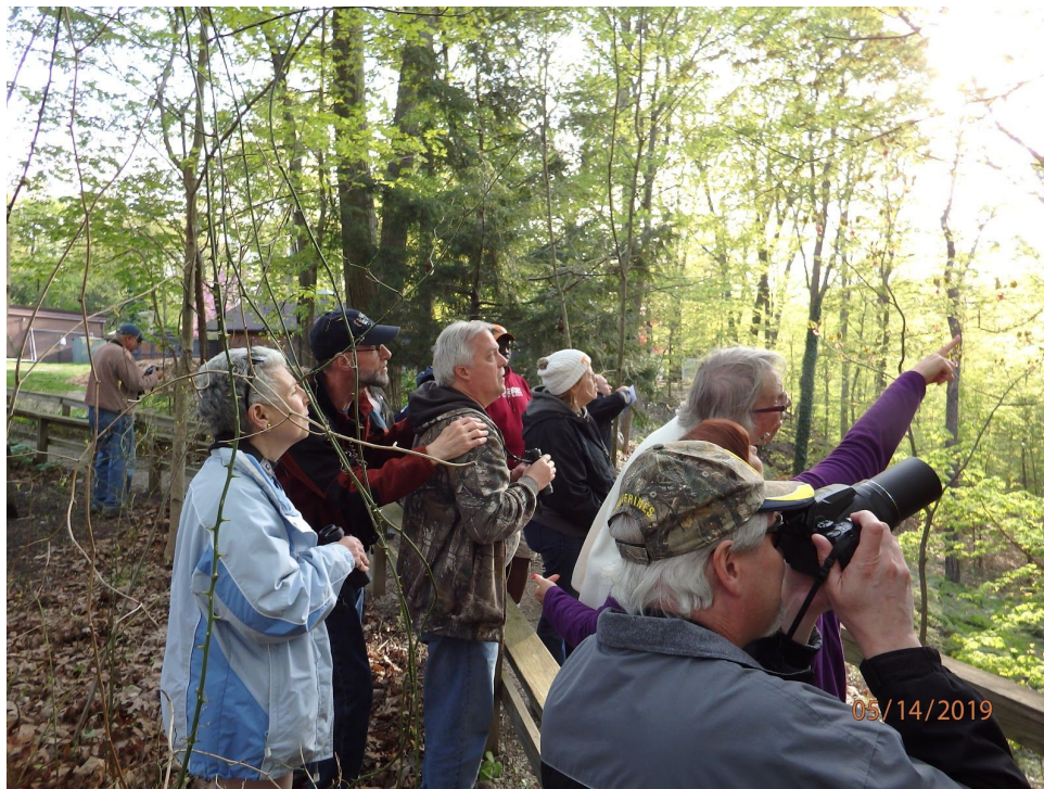
Early Evening Birders, Early Evening Bird Walk to Lake Erie Nature and Science Center, Tuesday, May 14, 2019, Lake Erie Nature and Science Center, 28728 Wolf Rd, Bay Village, OH 44140.