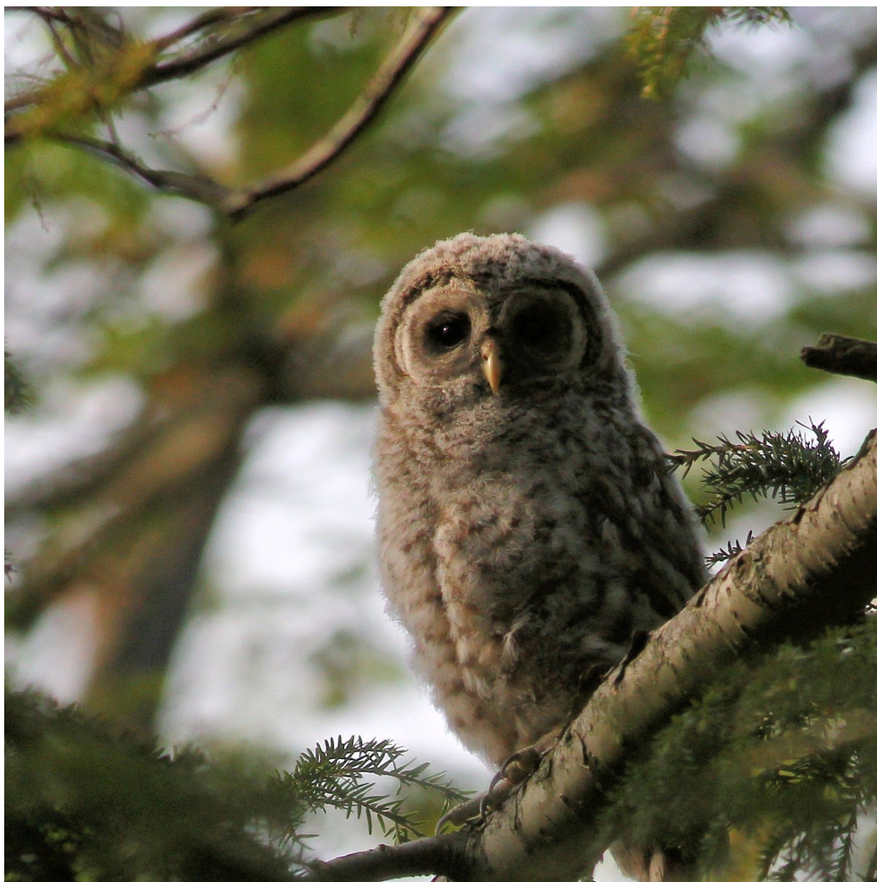
Barred Owl ( Strix varia) juvenile, Early Evening Bird Walk to Lake Erie Nature and Science Center, Tuesday, May 14, 2019, Lake Erie Nature and Science Center, 28728 Wolf Rd, Bay Village, OH 44140.