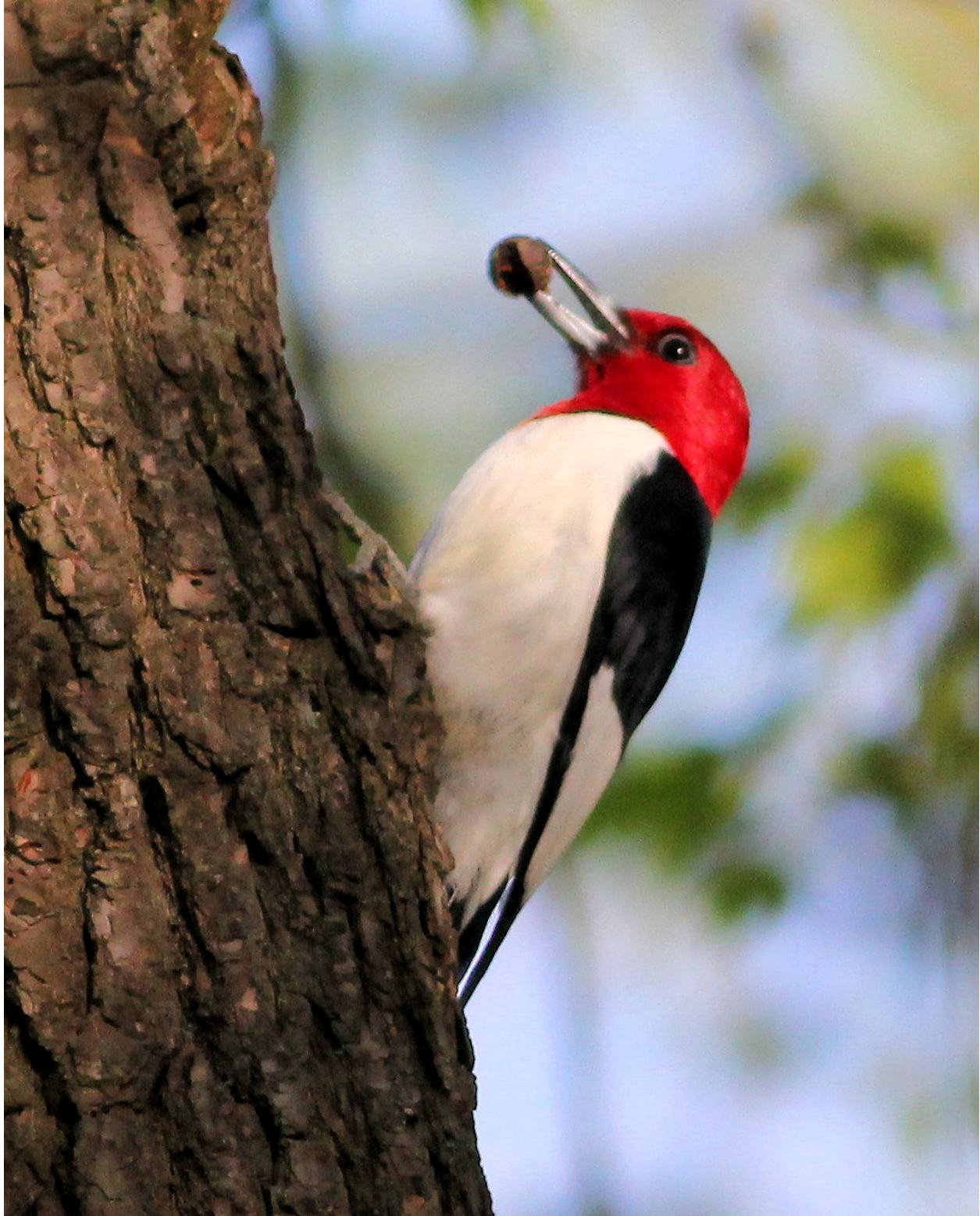
Photo: Red-headed Woodpecker ( Melanerpes erythrocephalus ) by Tom Fishburn, Early Evening Bird Walk to Lake Erie Nature and Science Center, Tuesday, May 14, 2019, Lake Erie Nature and Science Center, 28728 Wolf Rd, Bay Village, OH 44140.