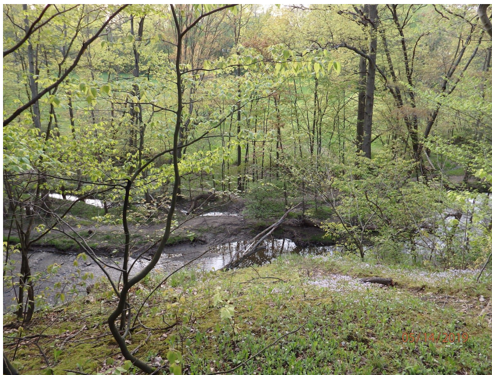
Early Evening Bird Walk to Lake Erie Nature and Science Center, Tuesday, May 14, 2019, Lake Erie Nature and Science Center, 28728 Wolf Rd, Bay Village, OH 44140.