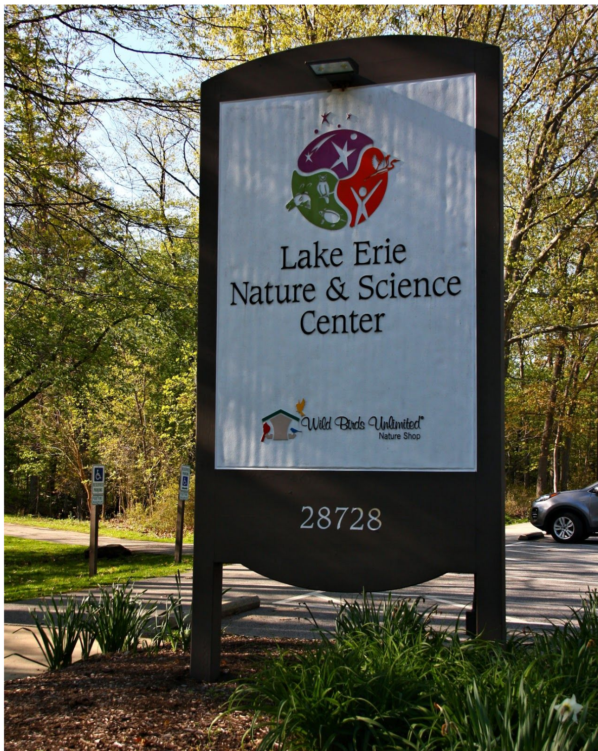
Lake Erie Nature and Science Center sign, Early Evening Bird Walk to Lake Erie Nature and Science Center, Tuesday, May 14, 2019, Lake Erie Nature and Science Center, 28728 Wolf Rd, Bay Village, OH 44140.