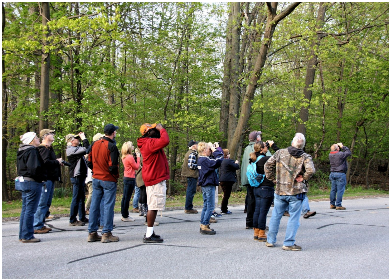
Early Evening Bird Walk to Lake Erie Nature and Science Center, Tuesday, May 14, 2019, Lake Erie Nature and Science Center, 28728 Wolf Rd, Bay Village, OH 44140.