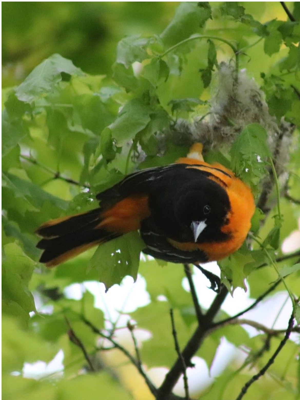
Bird entanglement, Early Evening Bird Walk to Lake Erie Nature and Science Center, Tuesday, May 14, 2019, Lake Erie Nature and Science Center, 28728 Wolf Rd, Bay Village, OH 44140.