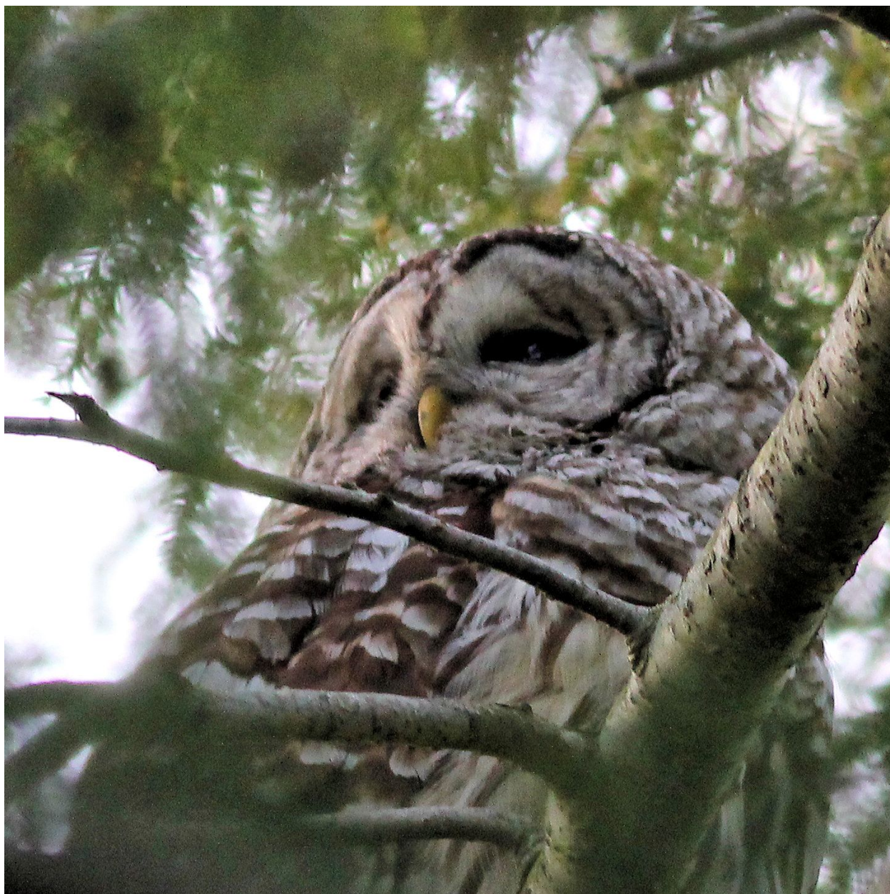
Barred Owl ( Strix varia), Early Evening Bird Walk to Lake Erie Nature and Science Center, Tuesday, May 14, 2019, Lake Erie Nature and Science Center, 28728 Wolf Rd, Bay Village, OH 44140.