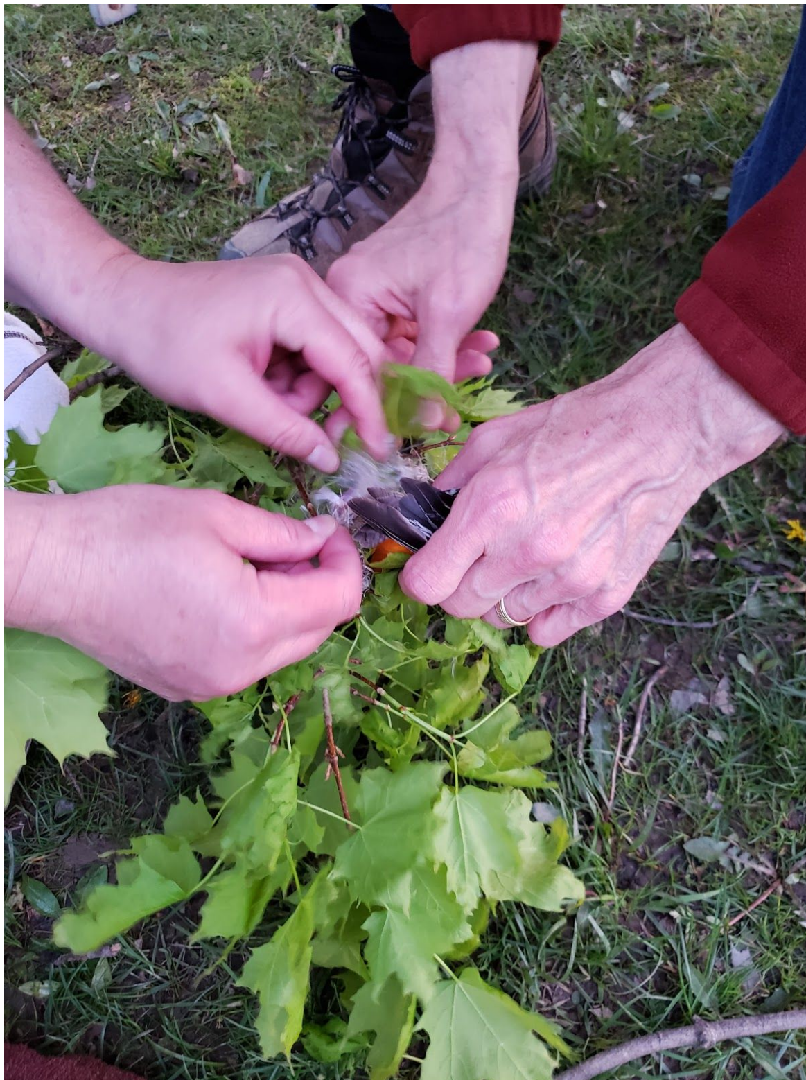
Photo: Bird entanglement, Early Evening Bird Walk to Lake Erie Nature and Science Center, Tuesday, May 14, 2019, Lake Erie Nature and Science Center, 28728 Wolf Rd, Bay Village, OH 44140.