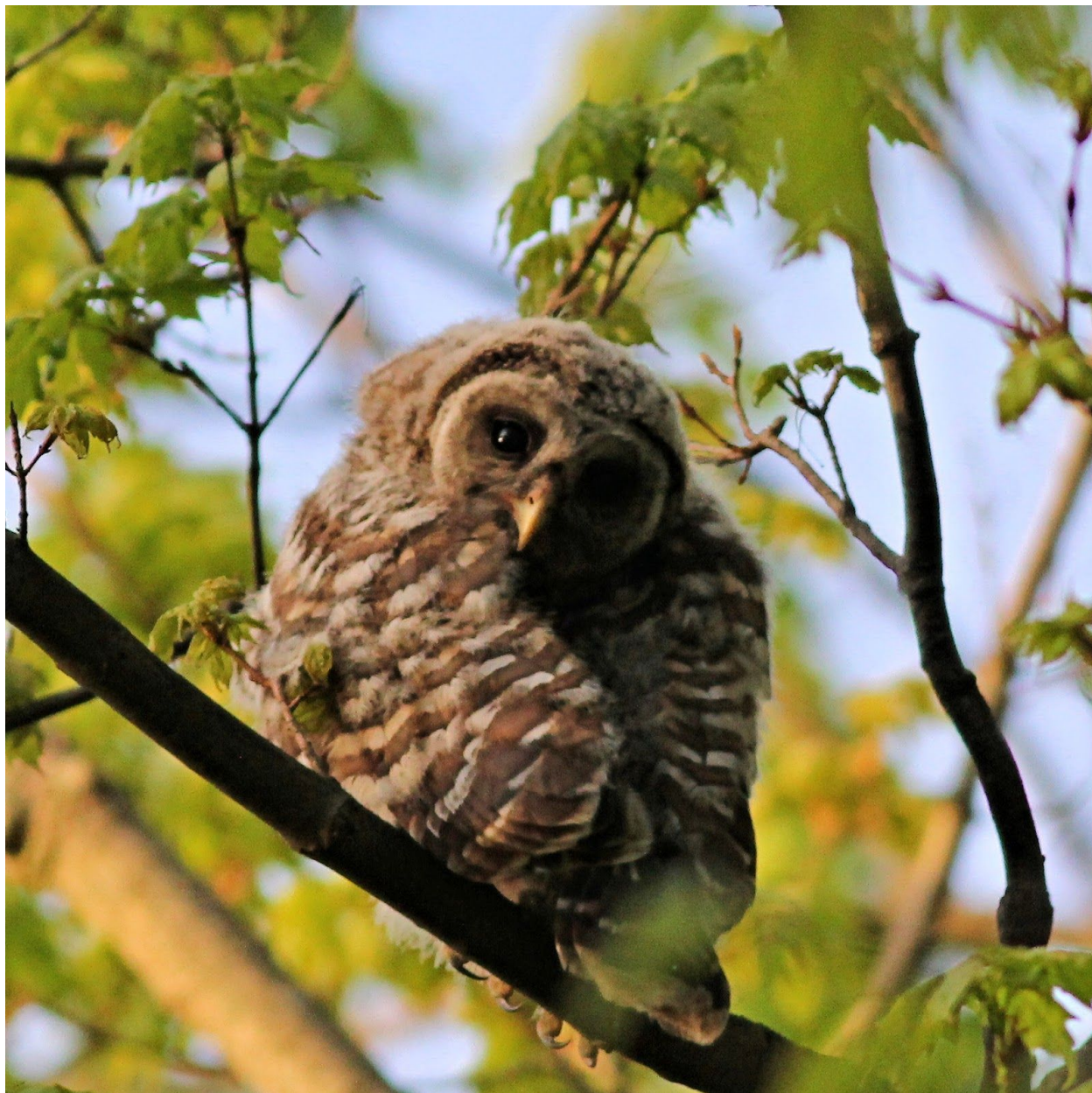
Barred Owl ( Strix varia) juvenile, Early Evening Bird Walk to Lake Erie Nature and Science Center, Tuesday, May 14, 2019, Lake Erie Nature and Science Center, 28728 Wolf Rd, Bay Village, OH 44140.