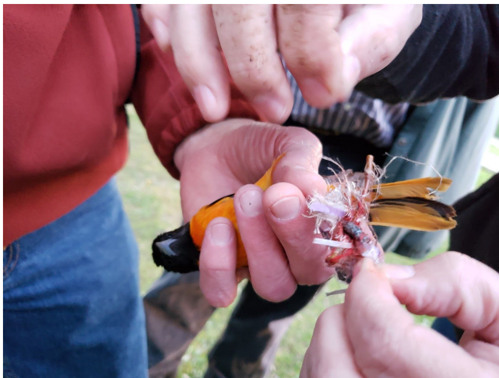
Early Evening Bird Walk to Lake Erie Nature and Science Center, Tuesday, May 14, 2019, Lake Erie Nature and Science Center, 28728 Wolf Rd, Bay Village, OH 44140.