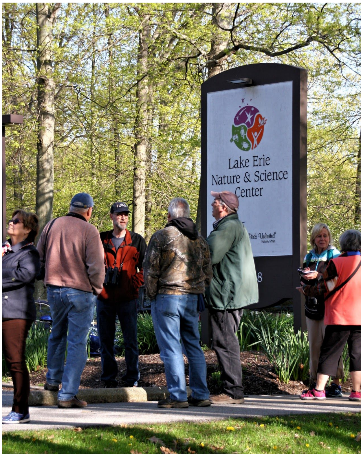
Walk Leaders Gather with the Group, Early Evening Bird Walk to Lake Erie Nature and Science Center, Tuesday, May 14, 2019, Lake Erie Nature and Science Center, 28728 Wolf Rd, Bay Village, OH 44140.