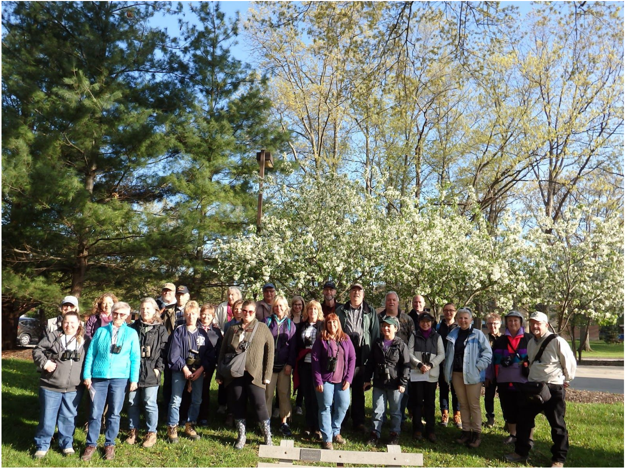
Early Evening Bird Walk Birders, Early Evening Bird Walk to Lake Erie Nature and Science Center, Tuesday, May 14, 2019, Lake Erie Nature and Science Center, 28728 Wolf Rd, Bay Village, OH 44140.