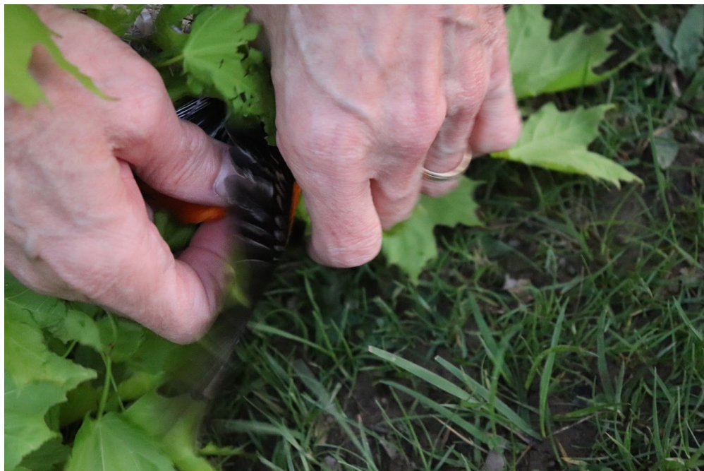
Early Evening Bird Walk to Lake Erie Nature and Science Center, Tuesday, May 14, 2019, Lake Erie Nature and Science Center, 28728 Wolf Rd, Bay Village, OH 44140.