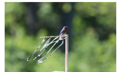
Eastern Bluebird on a "sparrow-spooker" by Lisa Gerbec

There is still time for more nests. We are continuing to monitor and will have year-end results around Labor Day.