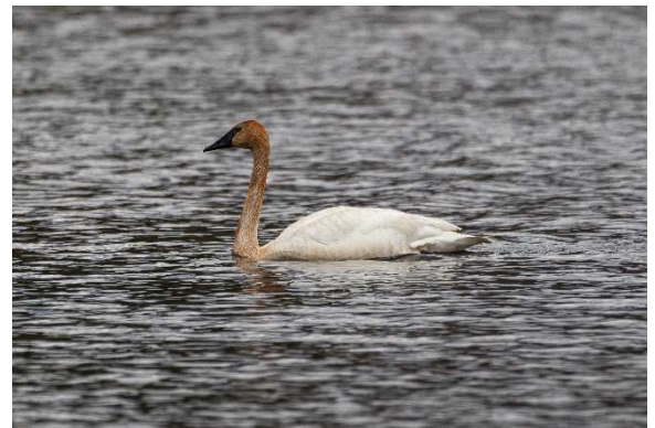
Trumpeter Swan at Lucia S Nash Preserve

Description: Trumpeter Swans were reintroduced in Ohio in the mid-1990s, and although they are still state-listed, the population continues to increase and expand in the state. Ohio is currently participating in a multi-state project evaluating the movement ecology of the Interior Population of Trumpeter Swans and what factors determine migratory behaviors of the swans throughout the region. This talk will provide an update on the current status of Ohio's trumpeter swan population and a preliminary report of 20 swans tracked in Ohio compared to other Trumpeter Swans in the Great Lakes region.