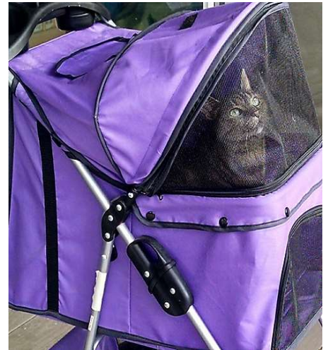
Zoey birding safely from her stroller

WCAS supports the protection of birds and bird habitats. We also understand the passion for companion pets and those who care for abandoned pets. The extent of research of cats on birdlife leads us to take the position that cats be kept indoors, or if outdoors, are haltered and leashed with a human companion. We encourage compassion toward all animals and applaud those who work to spay, neuter, vaccinate and find homes for stray and feral cats. We support the cat-caring community as well as those who protect birds and bird/wildlife habitats.