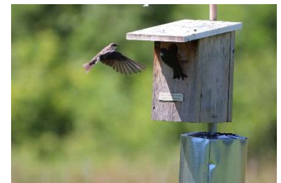
Tree Swallow approaching nest box by Lisa Gerbec