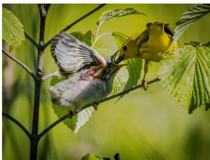
Yellow Warbler with Fledgling

New to birding? No problem! Grab a pair of binoculars and join us for our monthly bird walk at the Rocky River Nature Center trails. Our experienced leaders will help you get a look at the birds and are knowledgeable in answering your questions. You'll be amazed at how quickly you can learn!