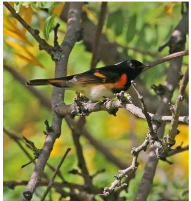
American Redstart