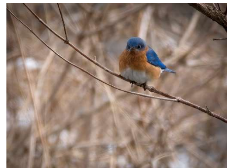
Eastern Bluebird

We just received the final report regarding the 6 Tree Swallows found dead in boxes earlier this year. ODNR found the birds to be emaciated. Perhaps this was due to weather conditions earlier this spring being uncondusive to building a sufficient population of insects for the birds to survive.