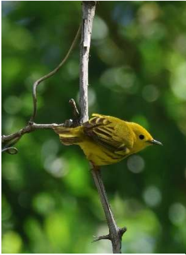
Yellow Warbler on Vine

The Tremont bird walk encourages an appreciation for the birds and wildlife in urban settings. We'll discover a variety of birds, plants, and other interesting bits of nature along the Ohio & Erie Canal Towpath Trail and Cuyahoga River on the 4th Saturday from January through November. New to birding? Bring binoculars if you have them, dress for the weather conditions, a water bottle, comfortable footwear, and curiosity about the natural world. Walking is relatively easy along the paved Towpath and urban streets. Join us and learn with this friendly group!