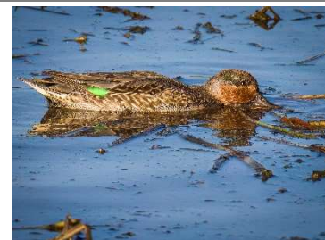
Photo: Green-winged Teal