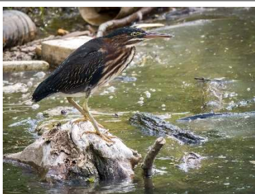
Photo: Green Heron