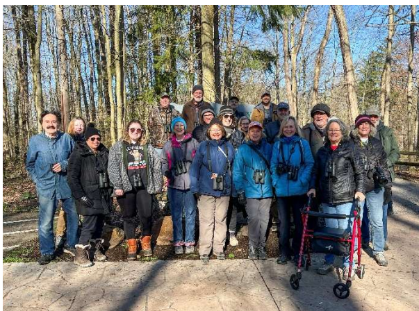
Photo: June 2024 Second Saturday Birders

Please join us the second Saturday of every month for our Second Saturday Bird Walk. We meet at the Rocky River Nature Center between the upper and lower parking areas and then take a few hours to explore the nature center trails. We had some exciting moments this past quarter with the discovery of a Cooper's Hawk, Blue-gray Gnatcatcher, Pileated Woodpecker, Wood Thrush, and Orchard Oriole nest. Late summer might be slow for birding, but there are still some great moments to be had. Last year in August we had eight Ruby-throated Hummingbird sightings and had the pleasure of watching an Eastern Kingbird family as the parents actively fed the begging juveniles.