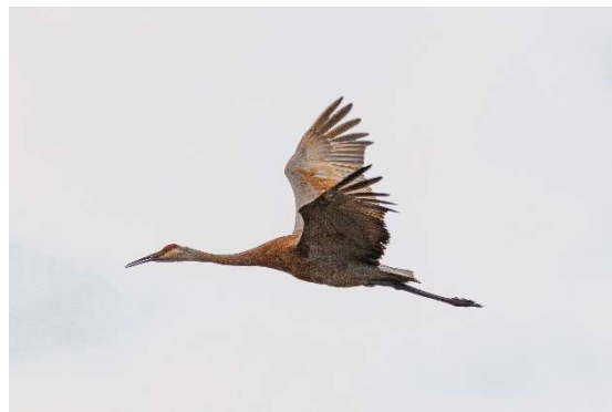
Photo: Sandhill Crane in Flight

Bald Eagle management by the Division of Wildlife includes habitat conservation with an emphasis on wetlands and wooded river corridors, working with rehabilitators who help injured birds, and enforcing state and federal protection.