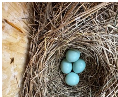
Photo: Bluebird eggs in Box 5, April 2024

Bluebird trails are much more than simply building and installing nesting boxes in strategic locations. Once the boxes are in place and the month of March begins, monitoring also begins. If the boxes are existing (i.e. have been up all winter), they need to be cleaned in preparation for the arrival of the birds. Boxes are checked every week or so to watch for nest-building. Monitors ascertain what type of bird is building a nest. If it is a native bird, typically an Eastern Bluebird or a Tree Swallow, we note the progress being made. If eggs are present, the frequency of the monitoring increases to about every three days. We track the number of eggs, the number that hatch, and when the birds fledge. After the young fledge and the adults leave, the box is cleaned and made ready for either another brood or overwintering.