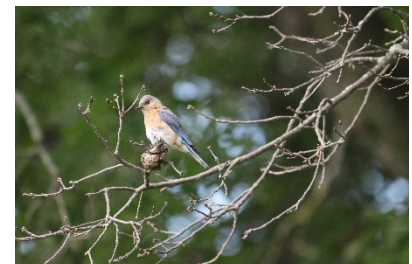
Photo: Eastern Bluebird perched on a tree branch by the bluebird trail by Lisa Gerbec

As many members know, WCAS is responsible for nine bluebird nesting boxes in the open area along the edge of Cleveland Metroparks' property which also features Lewis Road Riding Ring. Working in conjunction with the Metroparks, WCAS obtained and installed five nesting boxes in 2021. A Boy Scout Eagle project, permitted by the Metroparks, added four boxes in 2023. To date, these boxes have resulted in 33 Eastern Bluebird fledglings and 44 Tree Swallow fledglings! Currently there are five more young bluebirds and nine more young Tree Swallows that should be fledging soon. And the 2024 breeding season isn't over yet!