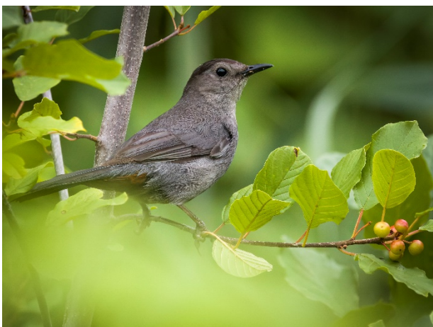
Photo: Gray Catbird

Gray Catbird: This common gray bird with its characteristic "mew" call uses coffee plantations in Central America and the Caribbean, where it can be found eating insects and berries among the coffee plants and understory.