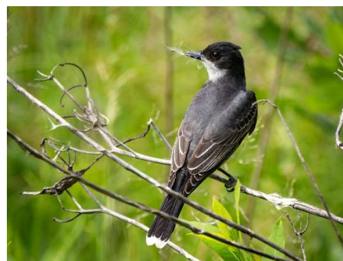
Photo: Eastern Kingbird