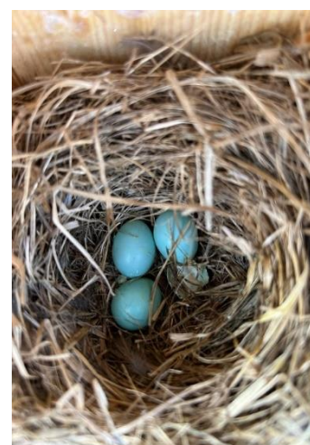
Abandoned Eastern Bluebird nest with broken egg