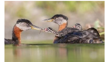
Red-necked Grebes – Youth Honorable Mention, 2024 Audubon Photography Awards

A ballerina-like Wild Turkey in an urban setting, Willow Ptarmigans blending into a white background, two male Blackburnian Warblers locked in battle, these describe just a couple of the winning entries from the 2024 Audubon Photography Awards . Western Cuyahoga Audubon has been given the opportunity to share the twelve photographs by having them displayed at the Parma-Powers branch of the Cuyahoga County Public Library, 6996 Powers Blvd., Parma, 44129. The exhibit will begin on Sunday, August 31 and run through Sunday, September 28.