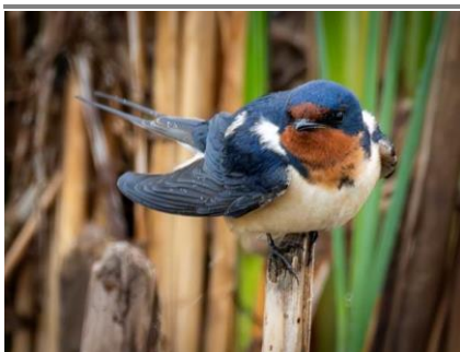
Photo: Barn Swallow

On the fourth Saturday of each month, we invite you to attend our Tremont Towpath Urban Bird Walk to explore the towpath through the Scranton Flats area. This past quarter, we were able to watch Barn Swallows up close and discuss their markings, which is a great thing to share with new birders. We also noted flocks of Blue Jays flying overhead. Some may be surprised to learn that there is a population of Blue Jays that are migratory. The jays in your yard/neighborhood are probably ones that remain here throughout the year; however, our Canadian friends get additional jays for the spring and summer. Please join us this season as we continue to explore the Scranton Flats for more excellent urban birds! Notice the earlier starting time for the September walk; we're starting a little early to avoid an event that day.