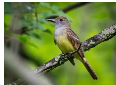
Photo: Great Crested Flycatcher at Huntington Reservation by Michelle Brosius