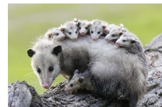
Virginia Opossum ( Didelphis virginiana ) female carrying young

Meeting ID: 893 0643 0100 and Passcode: 826424 (if needed)