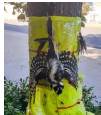
Photo: Downy Woodpecker stuck on sticky trap found in Brooklyn, NY by Sarah Valeri © National Audubon Society

A method some people have resorted to is placing sticky traps or sticky bands on trees/vegetation to catch the Lanternflies whether nymphs or adults. WCAS DOES NOT CONDONE USING STICKY TRAPS OR BANDS IN ANY WAY! The traps do not just catch insects. Birds and small animals can get trapped and die a tortured death from starvation, or, if they are able to escape, will often tear off fur, feathers, skin and even limbs. IF you see sticky traps/bands being sold at any store, garden center, online or elsewhere, please talk with the manager or contact the company about removing these products. If you do encounter a bird or other animal stuck on a trap, please contact the Lake Erie Nature and Science Center, www.lensc.org or 440-871-2900. A trained wildlife expert will come out and take the animal for rehabilitation. Birds and other wildlife will appreciate it.