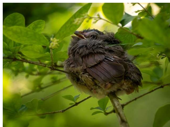
Photo: Northern Cardinal fledgling