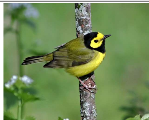
Photo: Hooded Warbler

Registration: Registration encouraged by RSVPing at the WCAudubon.org calendar: https://tockify.com/wcaudubon/detail/170/175050720000