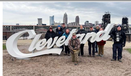
Photo: March 2025 Tremont Walk Group