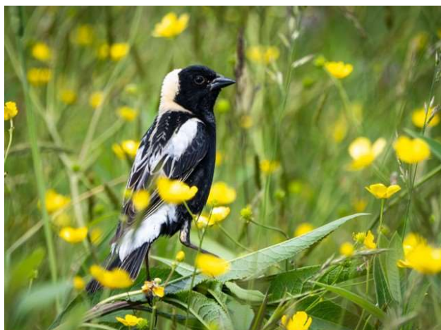
Bobolink with buttercups at South Russell Village Park

South Russell Village Park provides beautiful hiking trails through both field and forest habitats. By late spring, the field will be ablaze with yellow buttercups and the Bobolinks will be back from South America and settling in nicely at the park. Join us to get a glimpse of Bobolinks with buttercups! We'll also keep our eyes open for Eastern Bluebird, Savannah Sparrow, Eastern Meadowlark, and other grassland species.