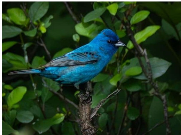
Indigo Bunting at Brecksville Reservation

We will meet at the nature center parking lot by the wood fence and then take some time to explore the wildflower field there that hosts bird species. We will then climb the scenic stairs to the Deer Lick Loop and explore the field/forest edge habitat at the Meadows Picnic Area. The group had some excellent species on this walk last summer like Eastern Towhee, Indigo Bunting, Northern Flicker, Chipping and Field Sparrow, Warbling Vireo, and Wood Thrush. Let's see what we can find this year!