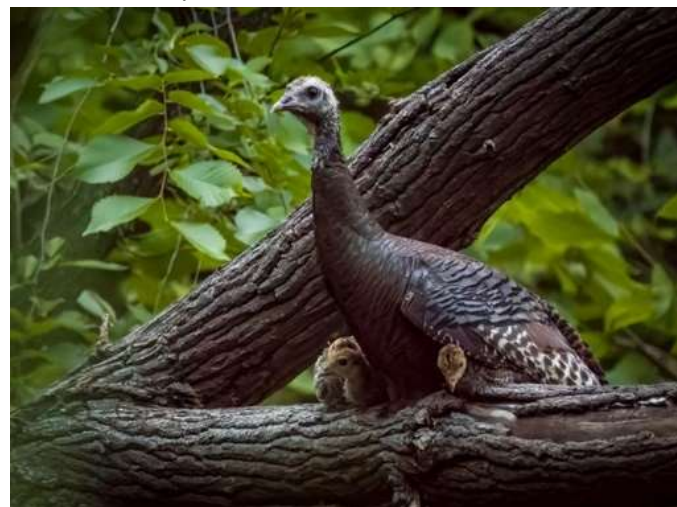
Wild Turkey hen and poults in the evening at Hemlock Creek Trail