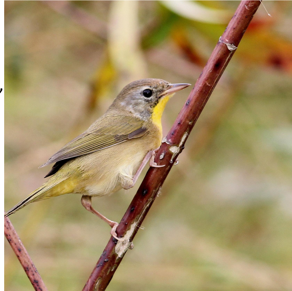
Above: Common Yellowthroat - Fall September 29, 2013 Mentor OH by Tom Fishburn.