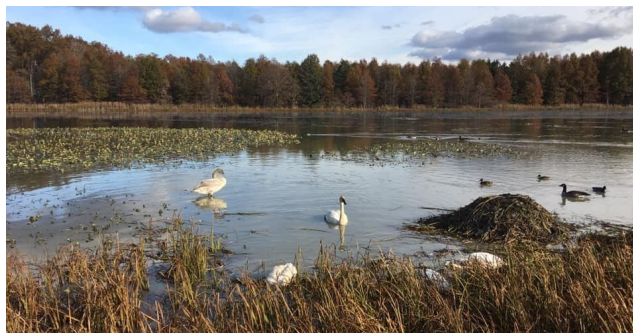
Above: Trumpeter Swans ( Cygnus buccinator), Sandy Ridge Reservation, 6195 Otten Rd, North Ridgeville, OH