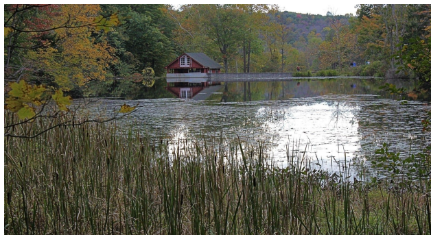
Above: Richfield Heritage Preserve, 4374 Broadview Rd, Richfield, OH