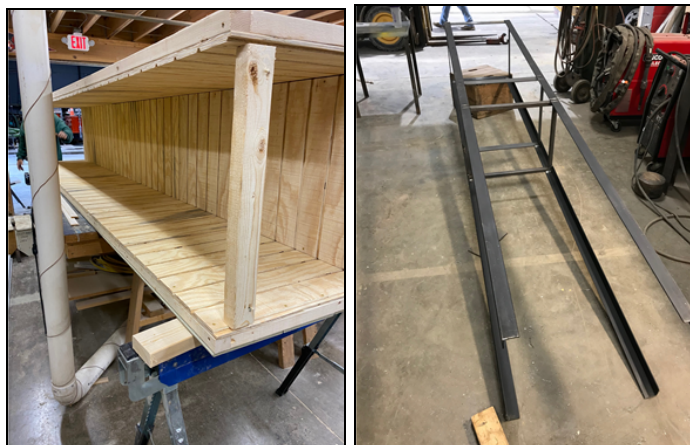
Above: Chimney Swift Tower construction by Amanda Sebrosky.

None of the tasks are too taxing but making sure that ladders, paint and all needed supplies and charged, portable power tools are assembled for transport 40 miles away is nerve racking. I don't know about you but I always miss something! Good thing I have a month to prepare!