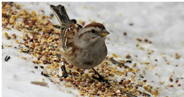
Above: American Tree Sparrow ( Spizella arborea ), Ohio & Erie Canal Reservation by Tom Fishburn.