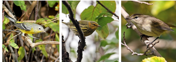
Fall Warblers (l to r): Magnolia Warbler ( Setophaga magnolia) at Mentor OH ; Cape May Warbler ( Setophaga tigrina) and Palm Warbler ( Setophaga palmarum)

Join the WCAS Bird Friendly Coffee Club ! Order coffee at the Birds & Beans® store at birdsandbeanscoffee.com/buycoffee Coffee is Smithsonian Migratory Bird Center Bird Friendly®-certified beans, 100 percent shade-grown, USDA Organic, and Fair-Trade certified. Use the 7-day WCAS Free Shipping Codes: Nov 23-29 'FRENOV', Dec 21-27 'FREEDEC' and Jan 25-31 'FREEJAN'. Note: 5% of annual chapter sales support WCAS conservation projects.