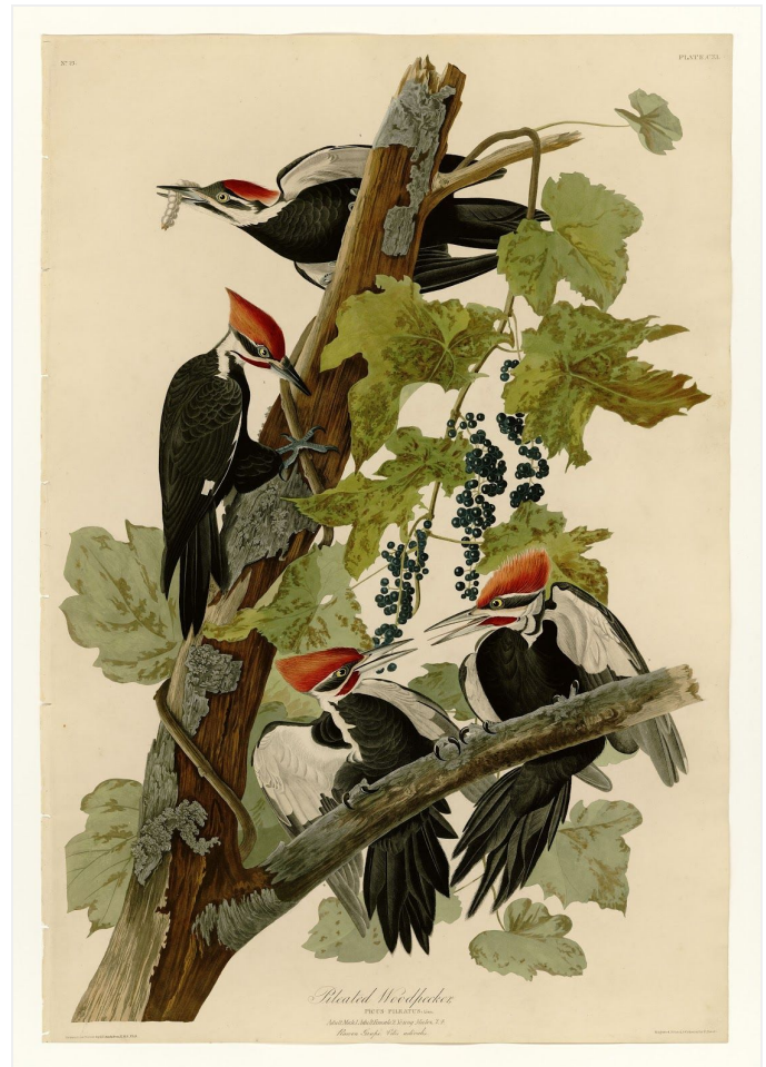
Above: Plate 111 depicts the Pileated Woodpecker ( Dryocopus pileatus ) from the book, The Birds of America by John James Audubon, naturalist and painter. Learn more at National Audubon here .

Read the related story on page 4 and see the map on page 5. Read Online