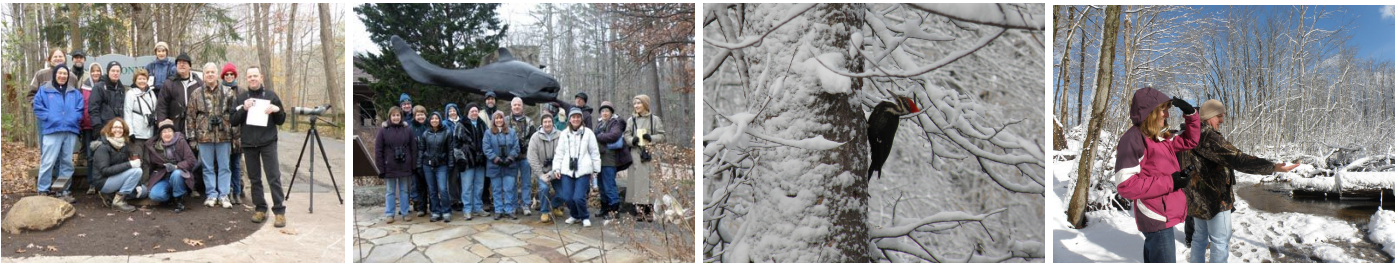
Above: November Birders, December Birders, Pileated Woodpecker, and Feeding the Chickadees © Penny O'Connor