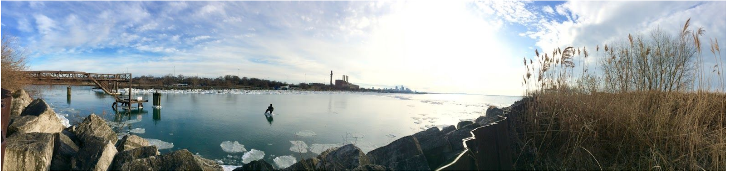
Photo: Whole View by Alice Merkel. Cleveland Lakefront Nature Preserve, Cleveland, Ohio.

(Help Western Cuyahoga Audubon End Ohio's Clean Energy Freeze! continued from Pg. 1)