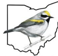
Ohio Young Birders Club FOUNDED IN 2006 BY BLACK SWAMP BIRD OBSERVATORY