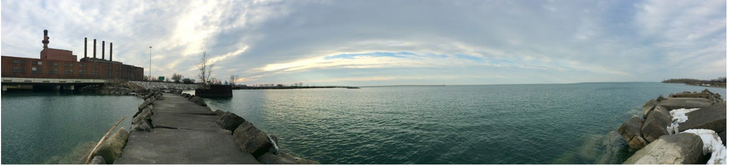
Cleveland East 55th St. Marina, Cleveland, Ohio.

Legislative update: On December 27, Ohio Governor Kasich vetoed legislation that would have made state renewable-energy and efficiency standards voluntary for the next two years. The veto of House Bill 554 means Ohio's traditional utilities as well as any other power company selling electricity here must supply an annually increasing percentage of power generated by wind, solar and other renewable technologies until that percentage is 12.5 percent in 2027.