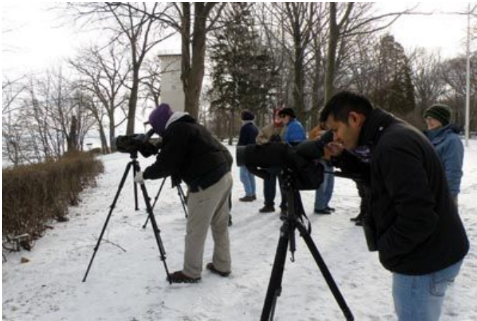
Photo: GBBC Birders at LENSAC 2013