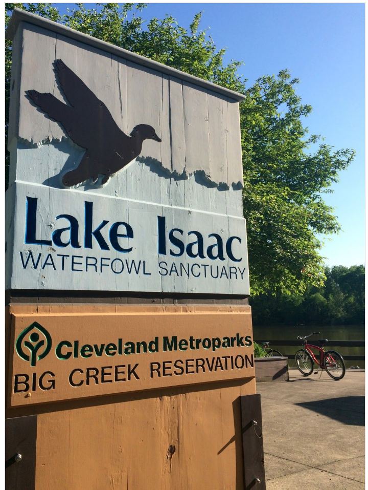
Photo: Lake Isaac

Carlisle Reservation is the largest in Lorain County Metro Parks, 1,917 acres. Eastern Meadowlarks and Eastern Bluebirds are among the many species to be seen here. Black River Audubon maintains 70 bluebird boxes in the area. We'll walk Equestrian Area grassland, forest and ponds.